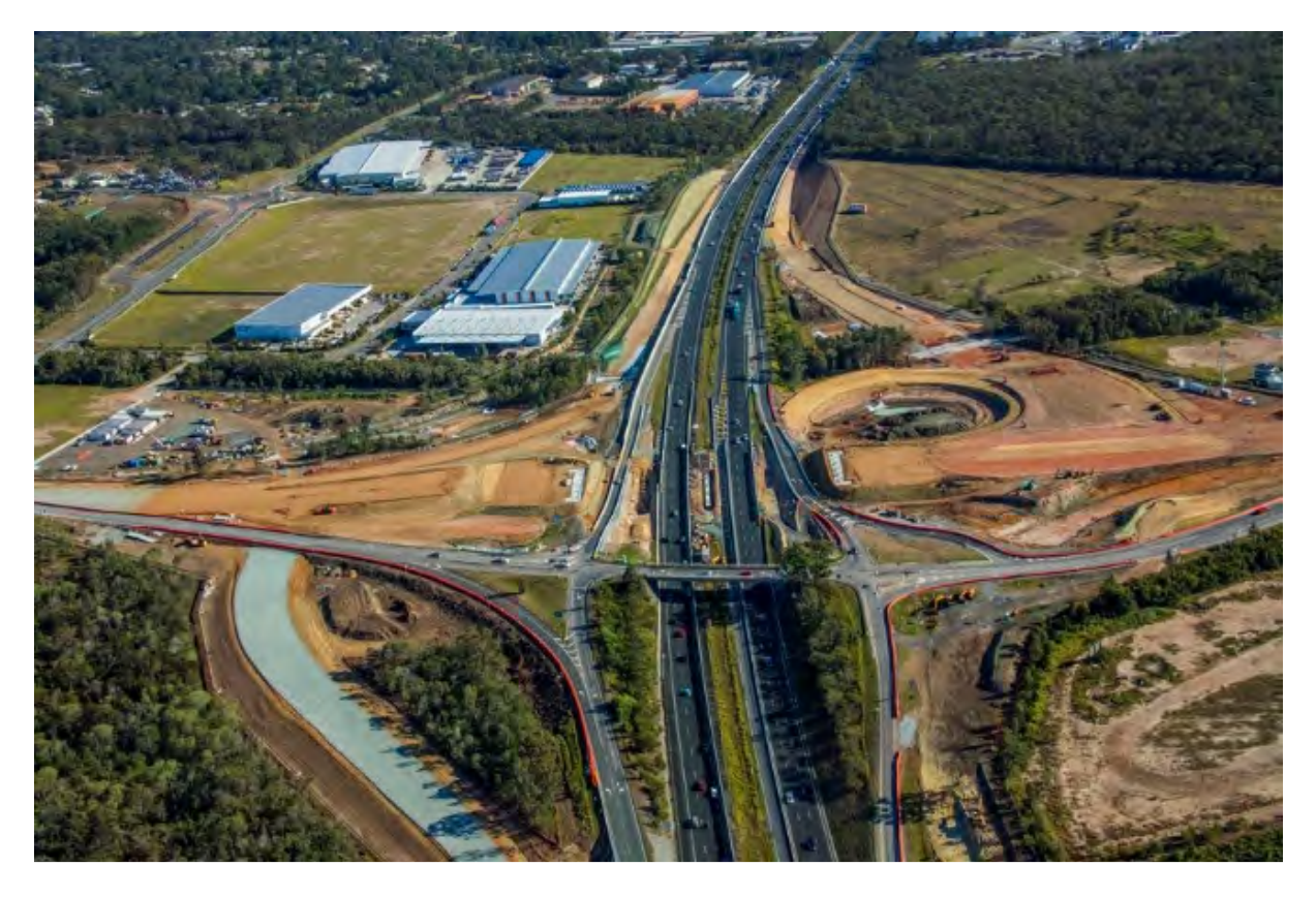
Boundary Road/Bruce Highway interchange upgrade – looking northbound