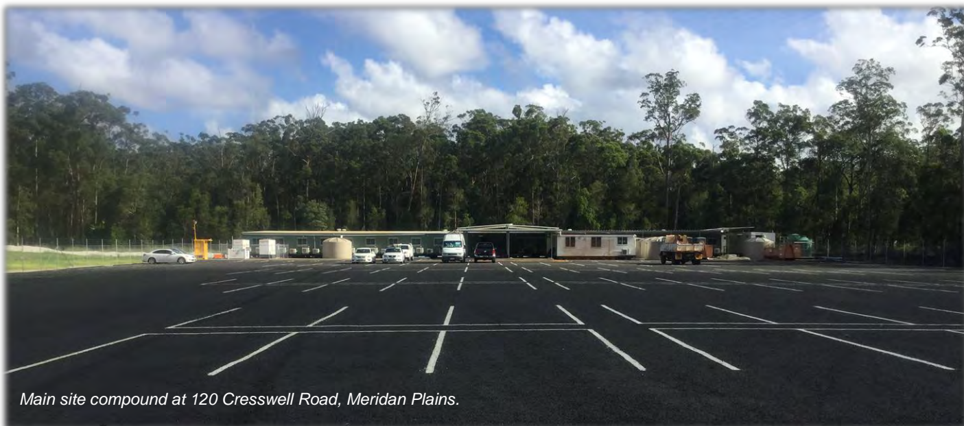
Main site compound at 120 Cresswell Road, Meridan Plains.

The project team would like to thank local residents for their patience during construction of this important project.