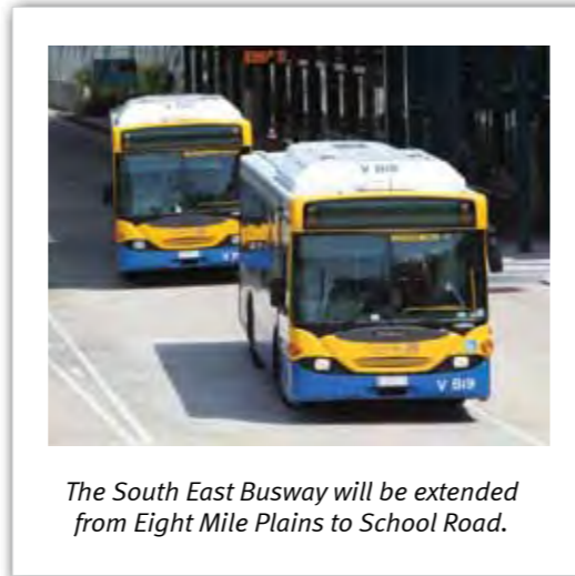
The South East Busway will be extended from Eight Mile Plains to School Road.

For more information log on to www.tmr.qld.gov.au and search 'Gateway Upgrade South Projects' and 'South East Busway extension'.