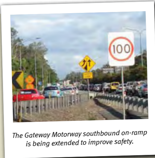
The Gateway Motorway southbound on-ramp is being extended to improve safety.