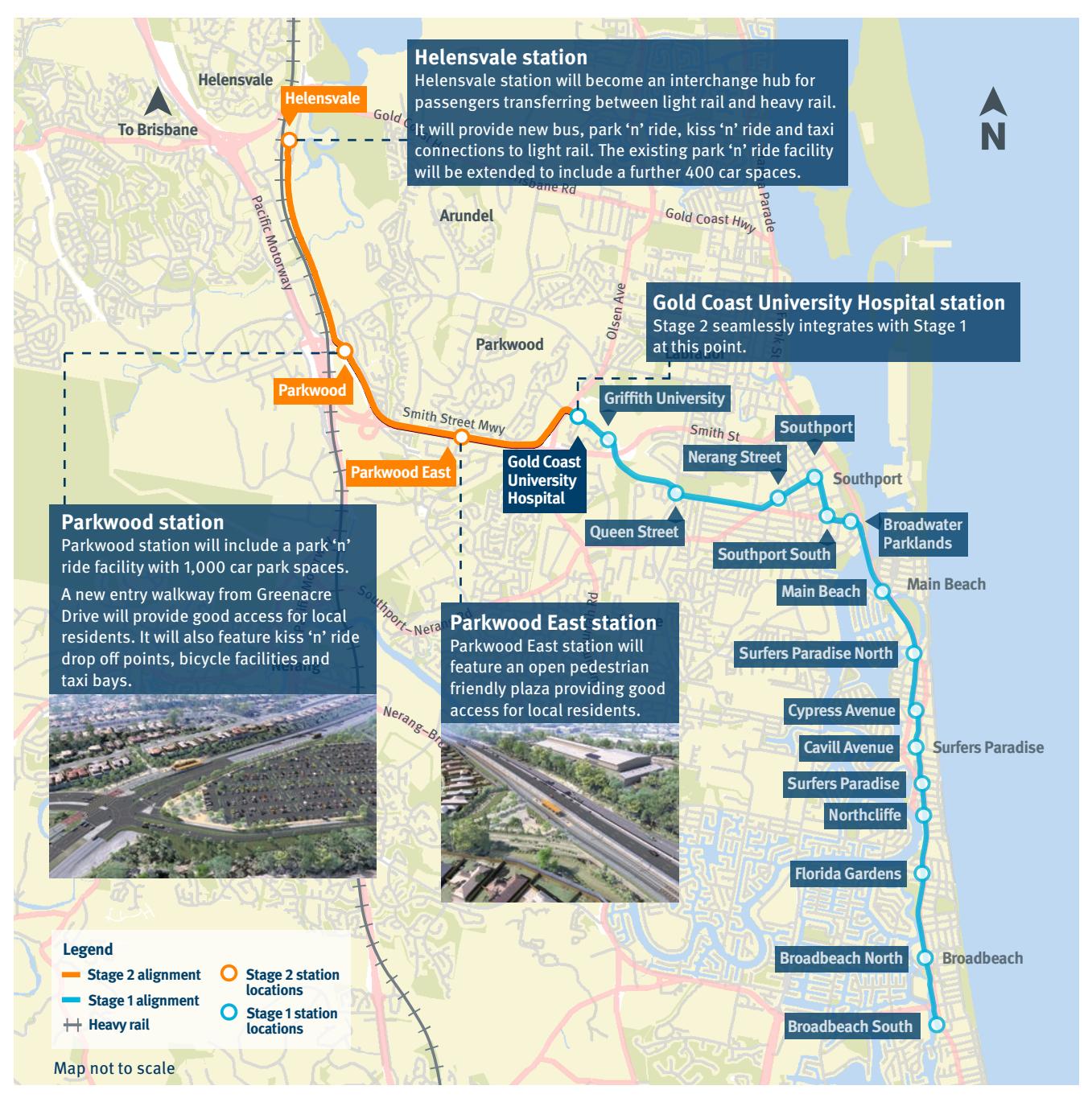
Figure 1: shows a map of the Gold Coast light rail network. Stage 1 extends 13 kilometres and includes 16 light rail stations (operational since July 2014). Stage 2 (highlighted in orange) extends 7.3 kilometres and includes three new light rail stations (yet to be constructed).