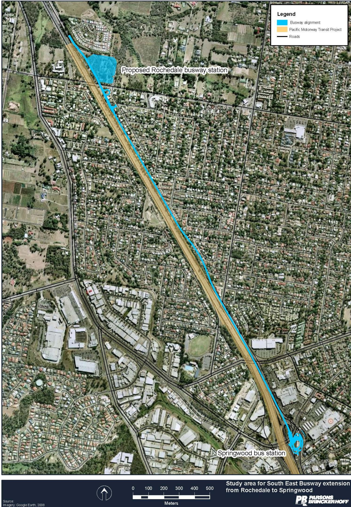
Figure 1-1: Study area for South East Busway extension from Rochedale to Springwood