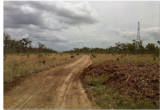
TRR4 alignment through bushland