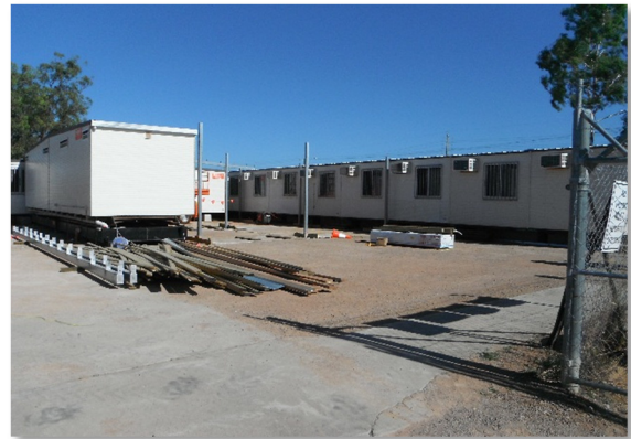
Site office under construction at Mt Low Parkway intersection