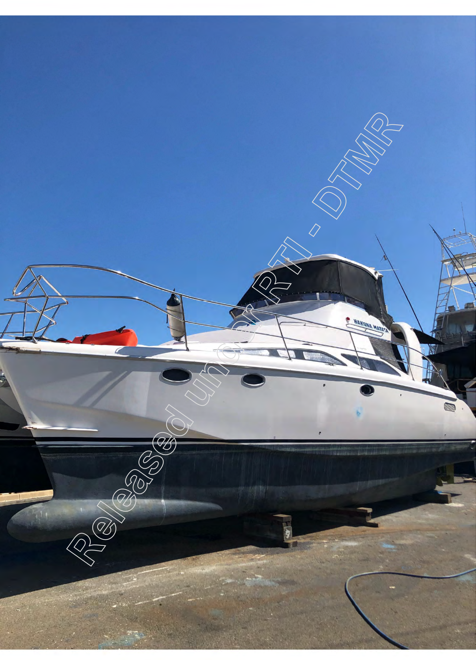
Page Number: 52 of 56