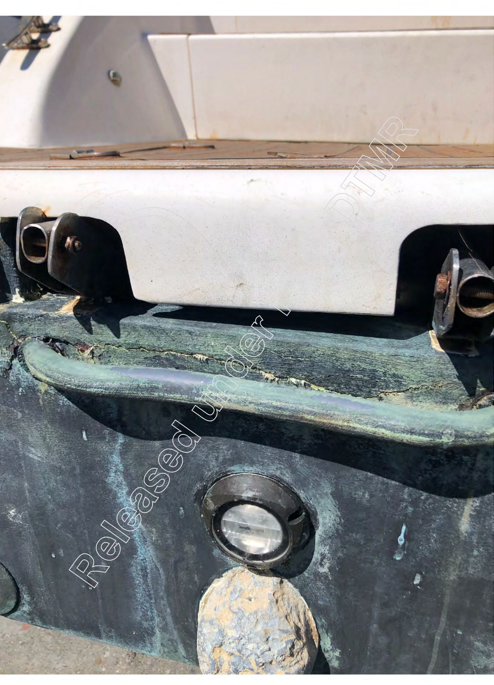
Page Number: 40 of 56