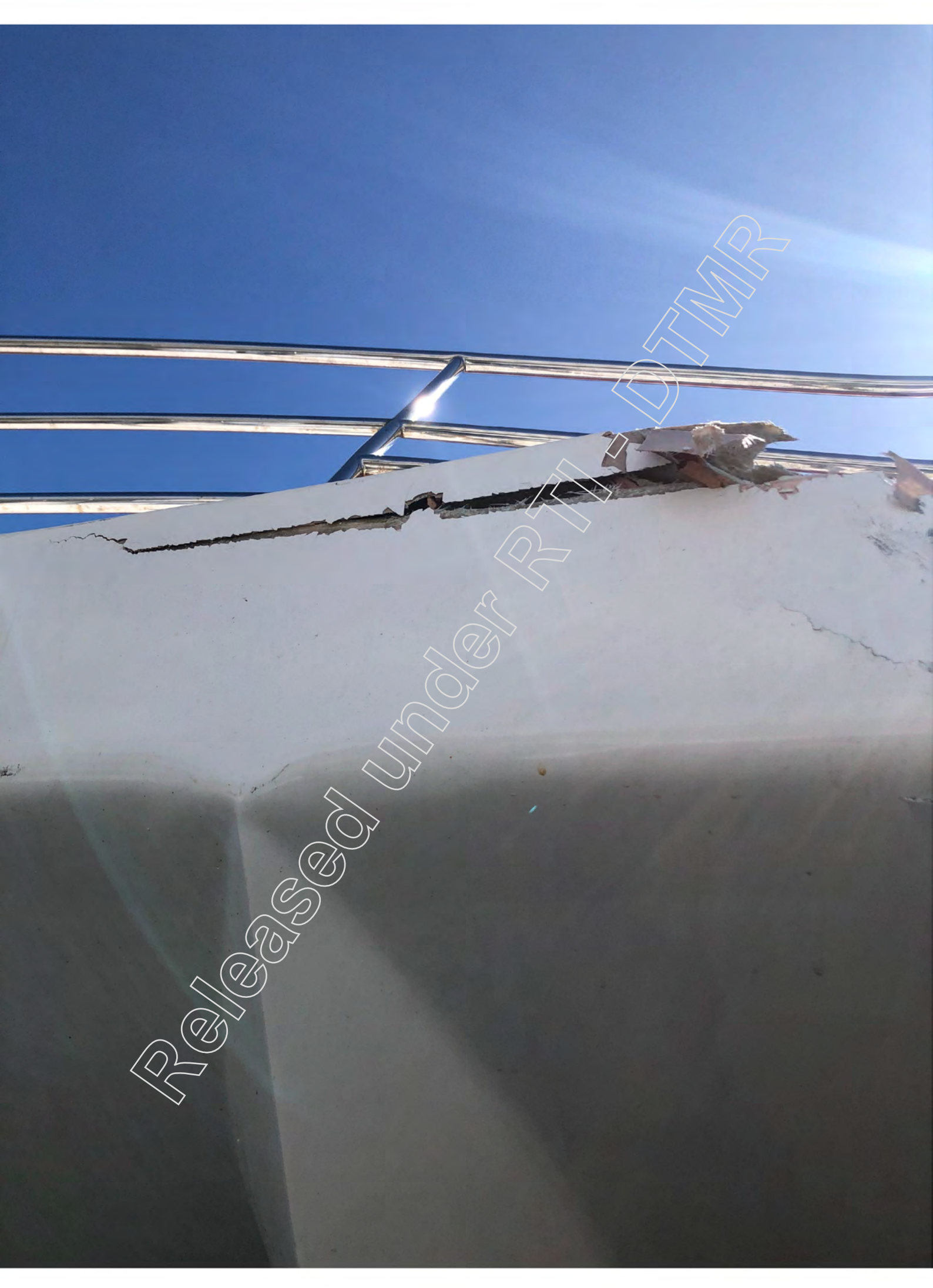
Page Number: 51 of 56