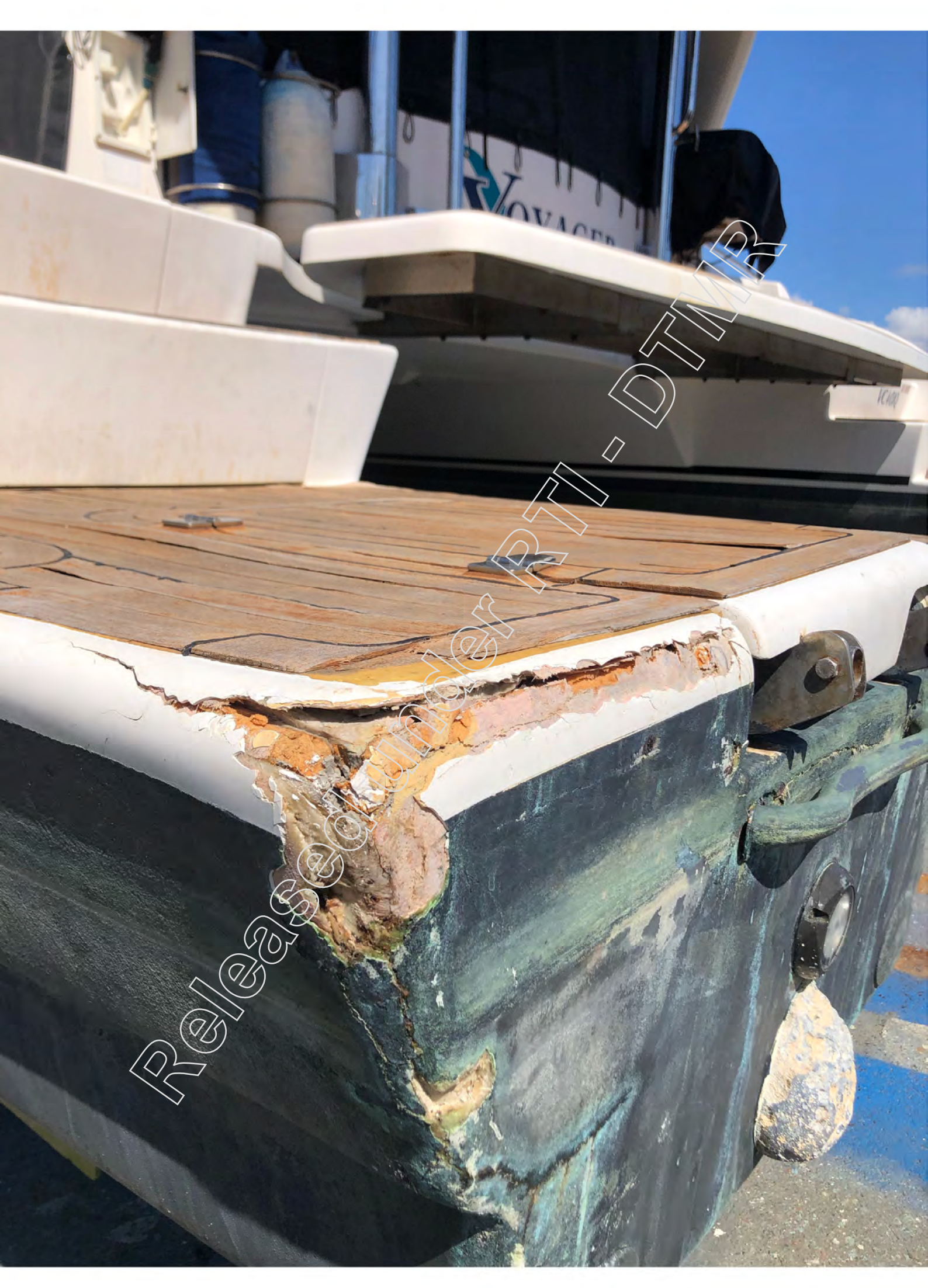
Page Number: 41 of 56