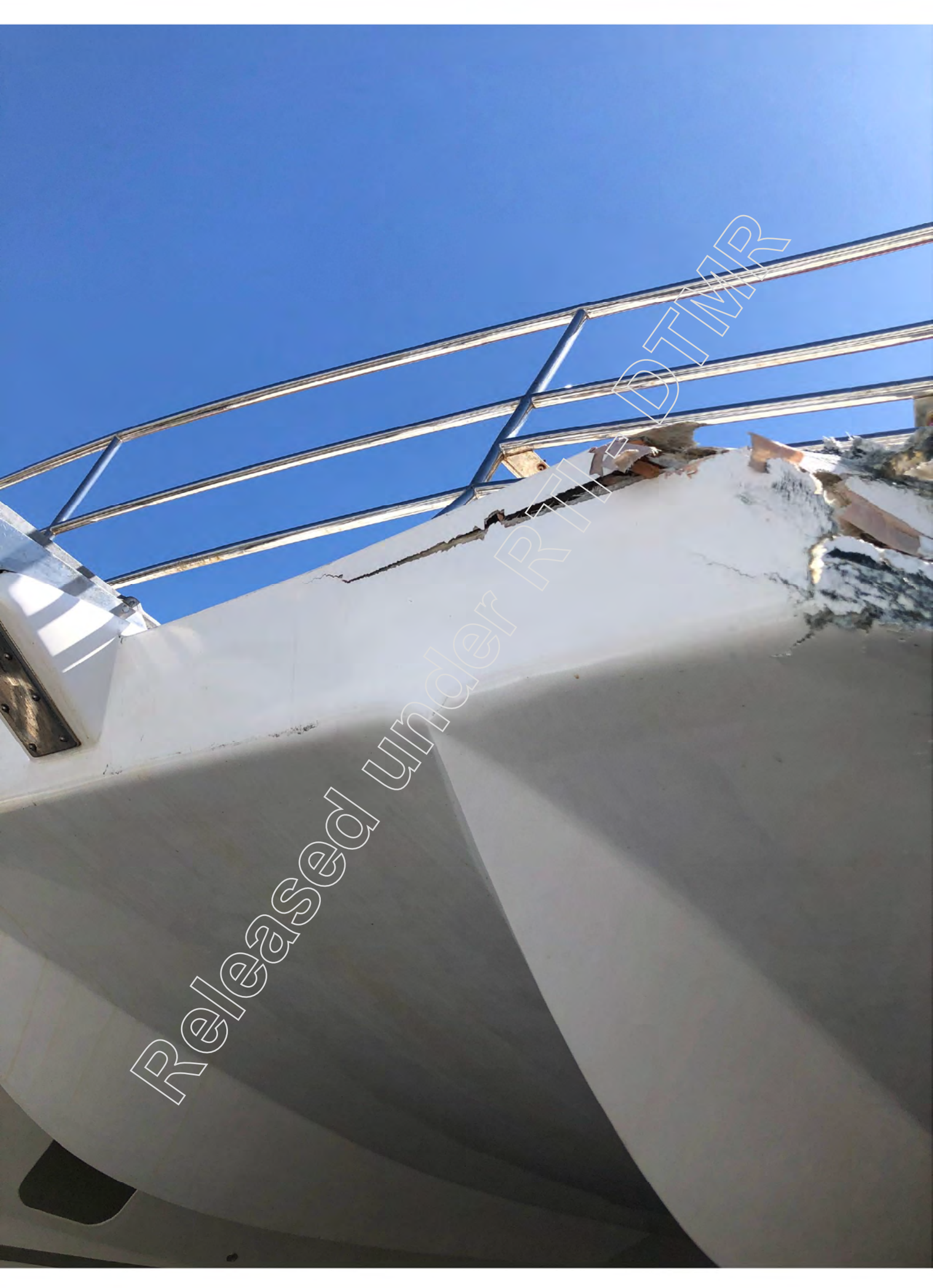
Page Number: 47 of 56