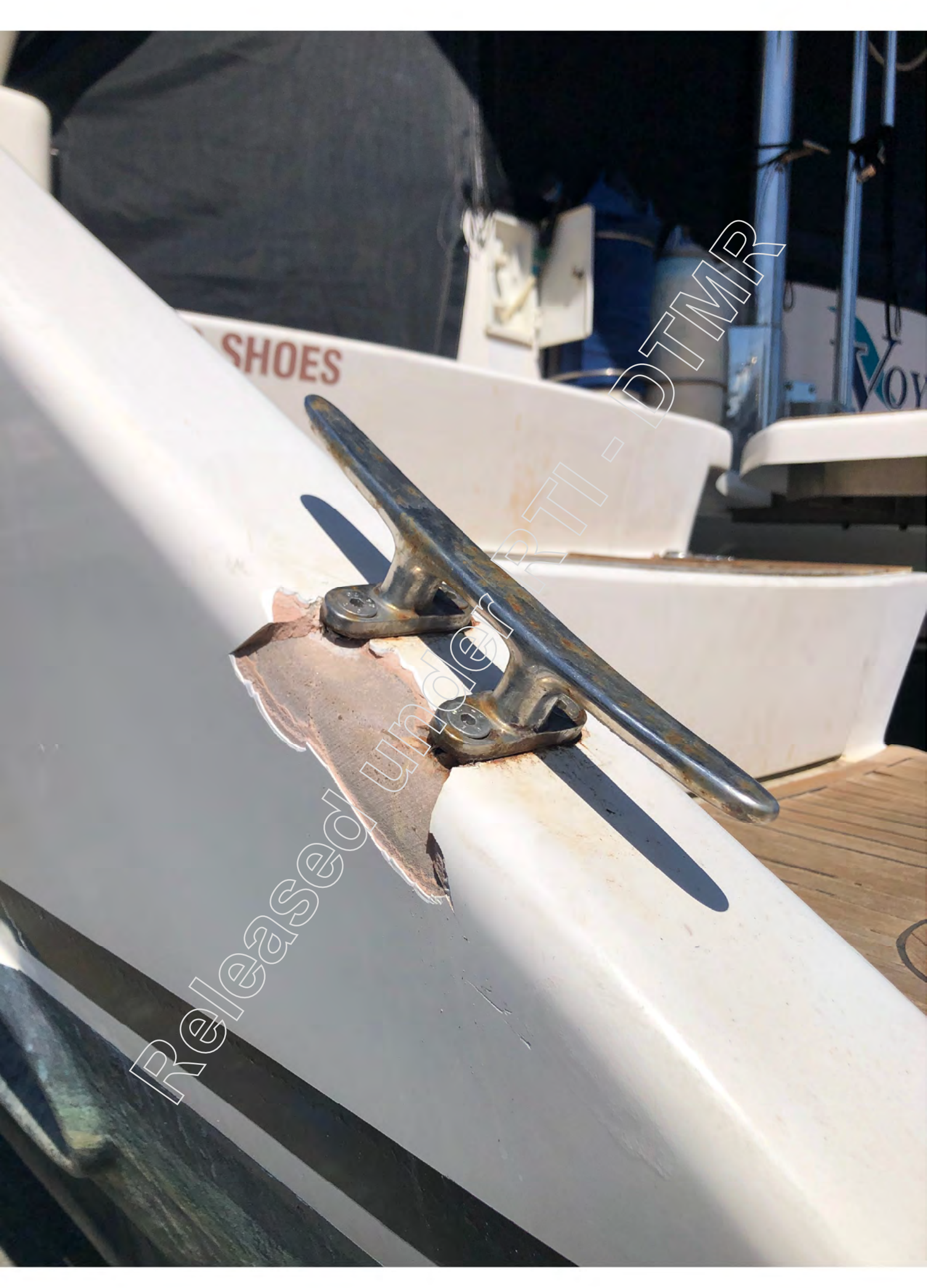
Page Number: 42 of 56