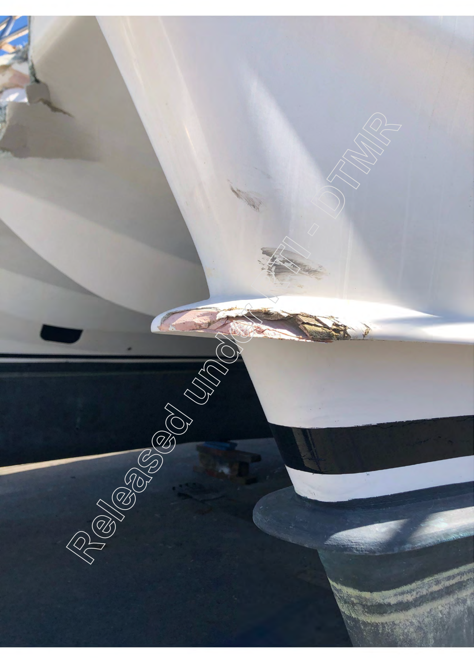
Page Number: 45 of 56