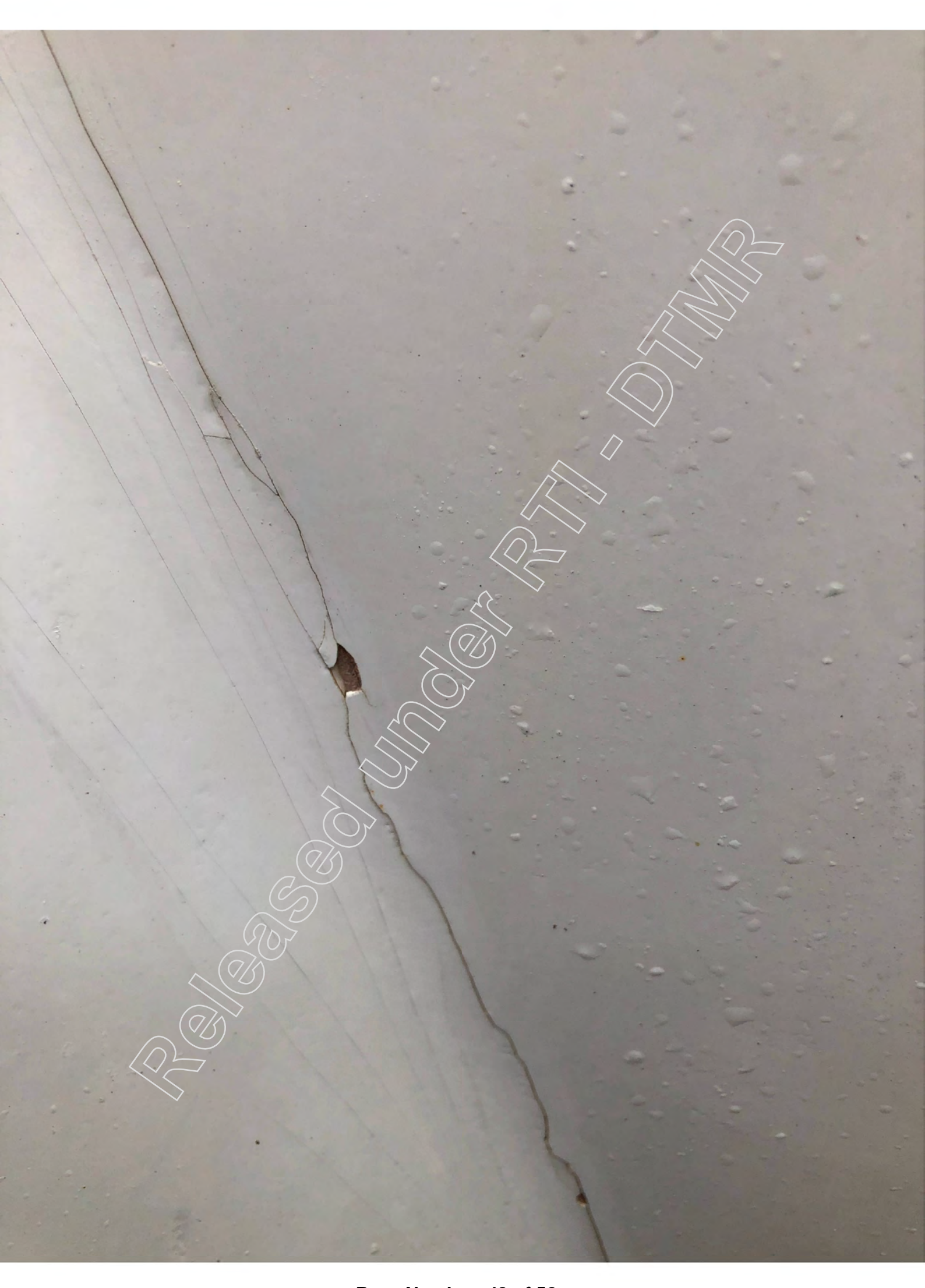
Page Number: 49 of 56