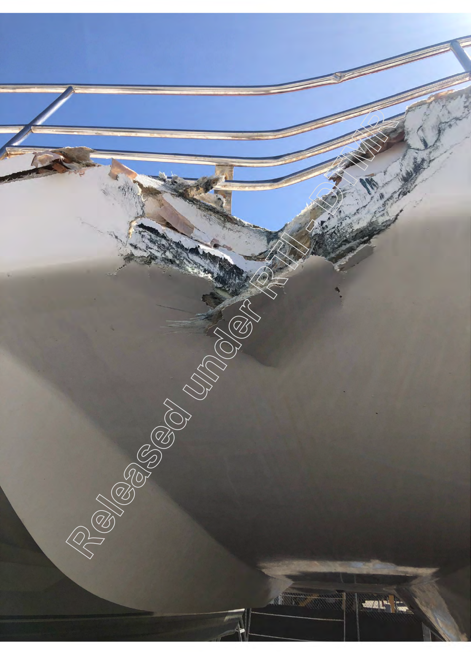
Page Number: 46 of 56