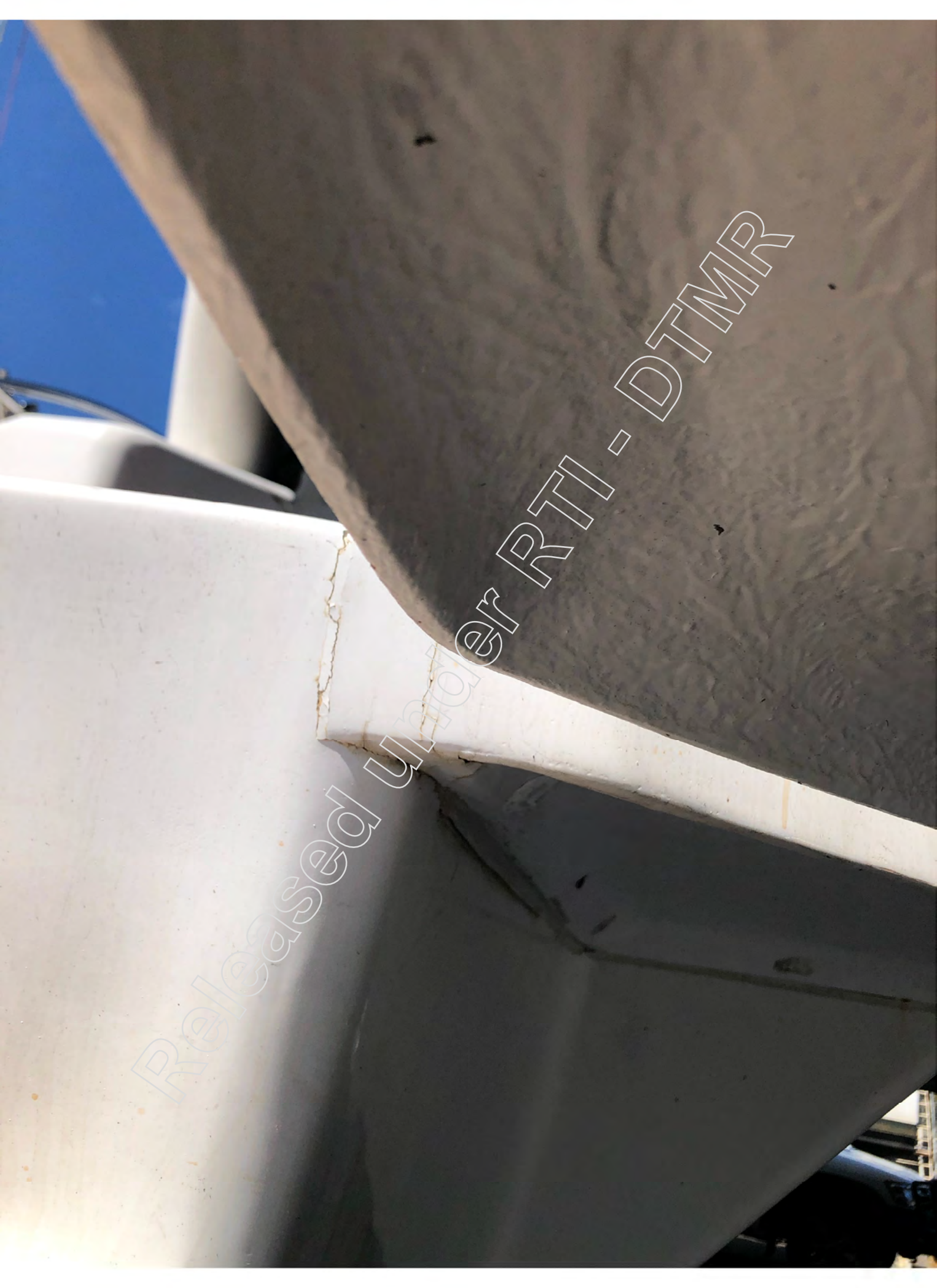
Page Number: 53 of 56