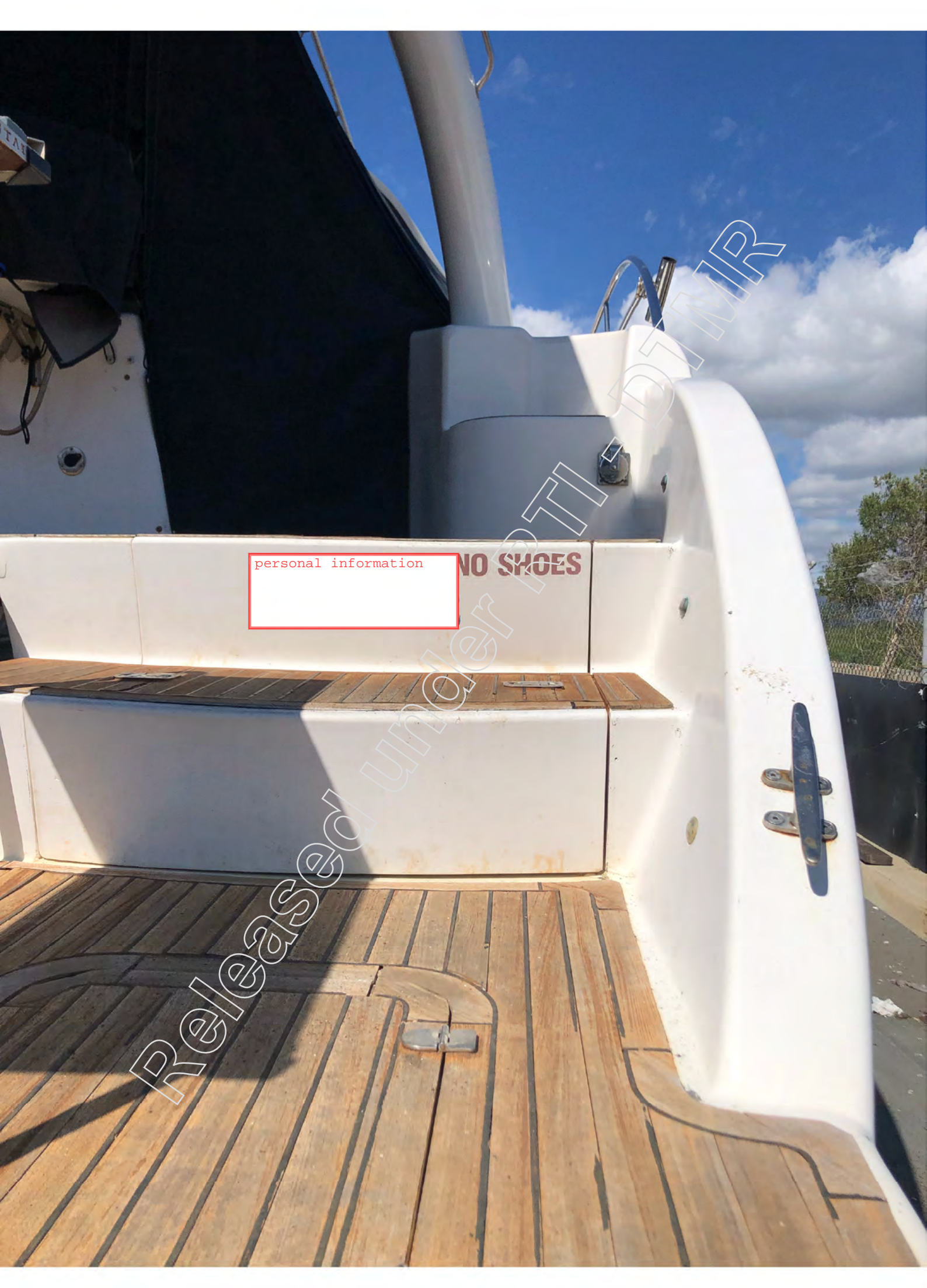
Page Number: 56 of 56