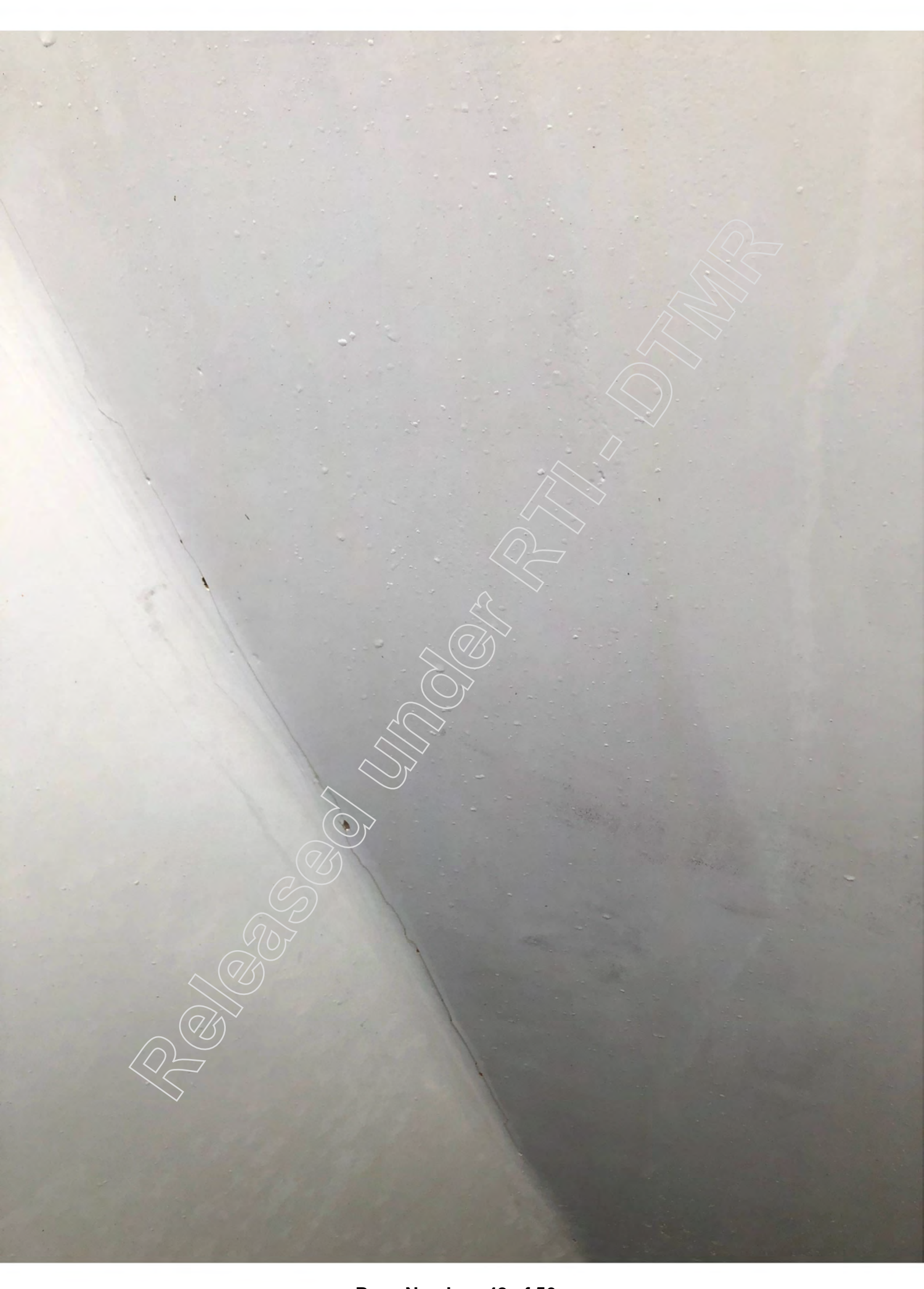
Page Number: 48 of 56