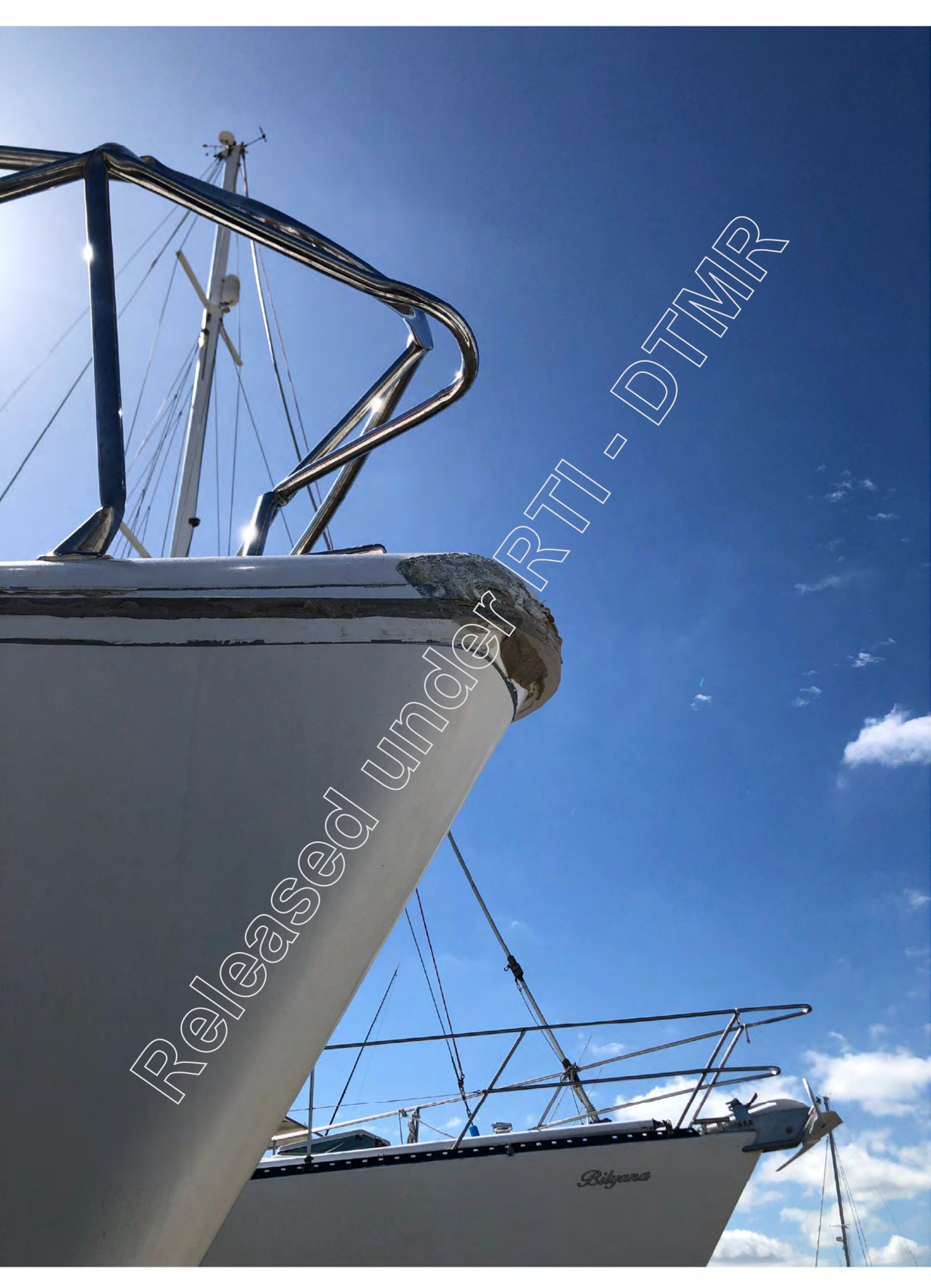
Page Number: 50 of 56