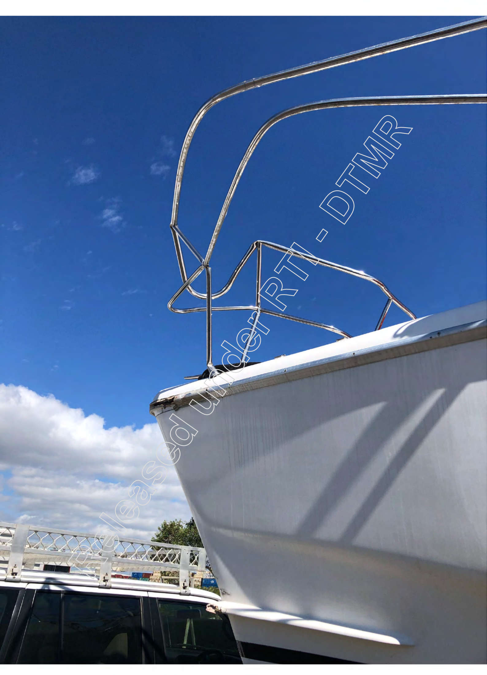
Page Number: 43 of 56