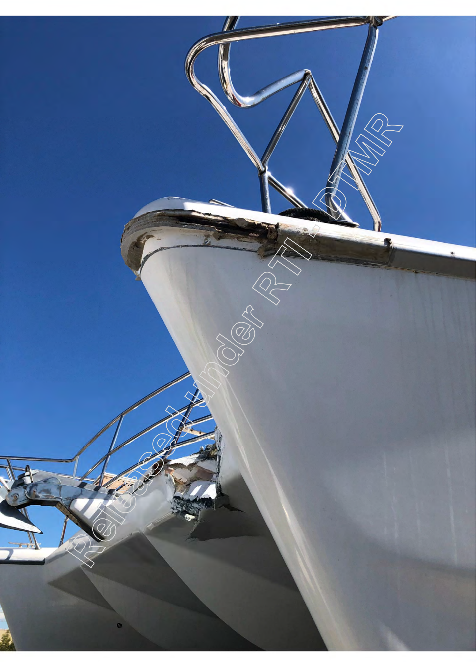
Page Number: 44 of 56