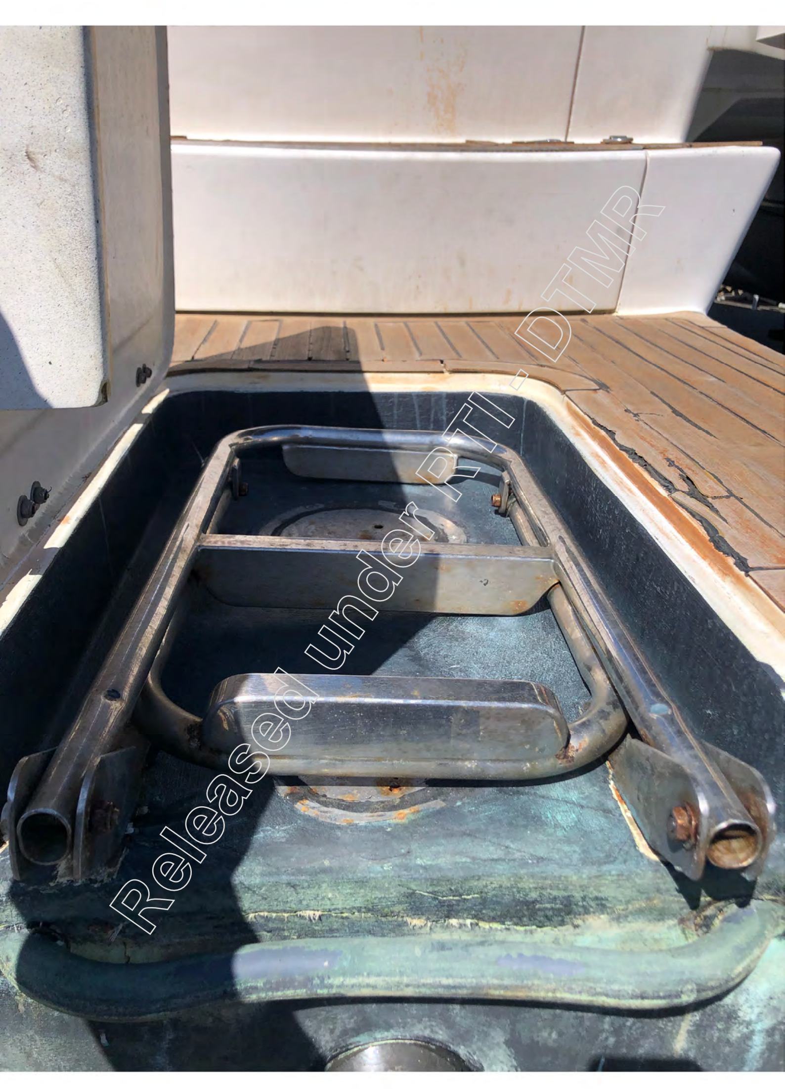
Page Number: 54 of 56