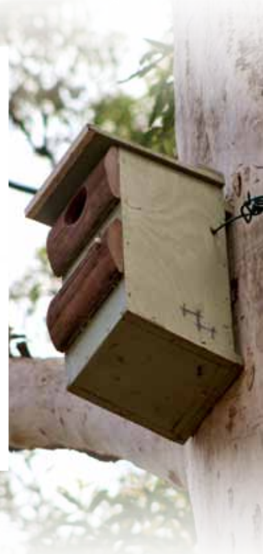
Management of flora and fauna has been a top priority on the project.