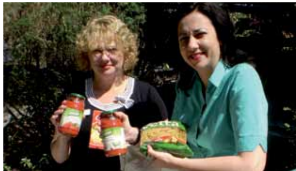
State Member for Inala, Anastacia Palaszczuk (right) presents the Inala Family Support Centre with food donated by the project team.