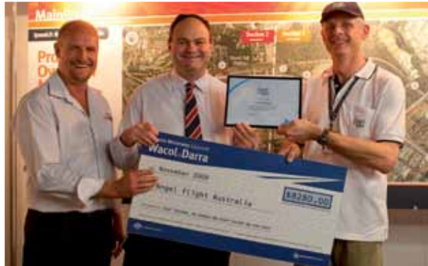
Presentation of the funds raised by the project team to Angel Flight Australia.