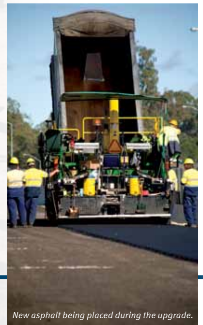
New asphalt being placed during the upgrade.