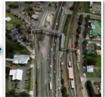
2 - Traffic through Goodna has been moved closer to the rail line.