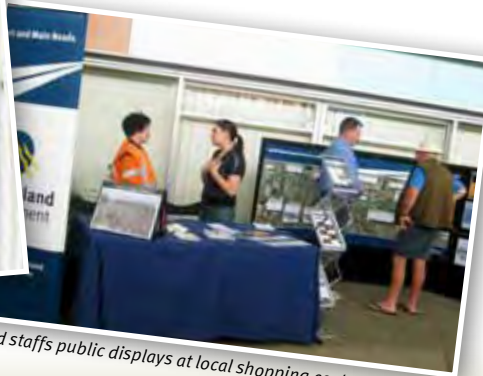
...and staffs public displays at local shopping centres.