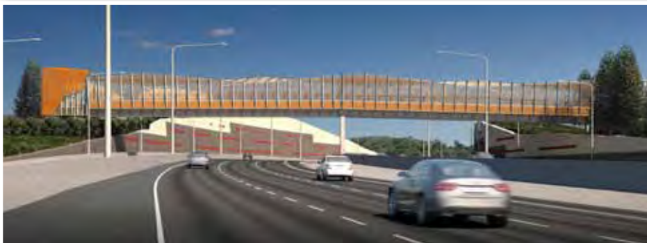
Artist's impression of the new Law Street pedestrian bridge at Redbank.