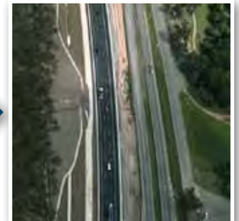
3 - Ipswich bound traffic is now on permanent motorway pavement through Goodna and Redbank.

Remember—traffic switches do not usually register on GPS devices, so please pay special attention to signage when travelling through the project.