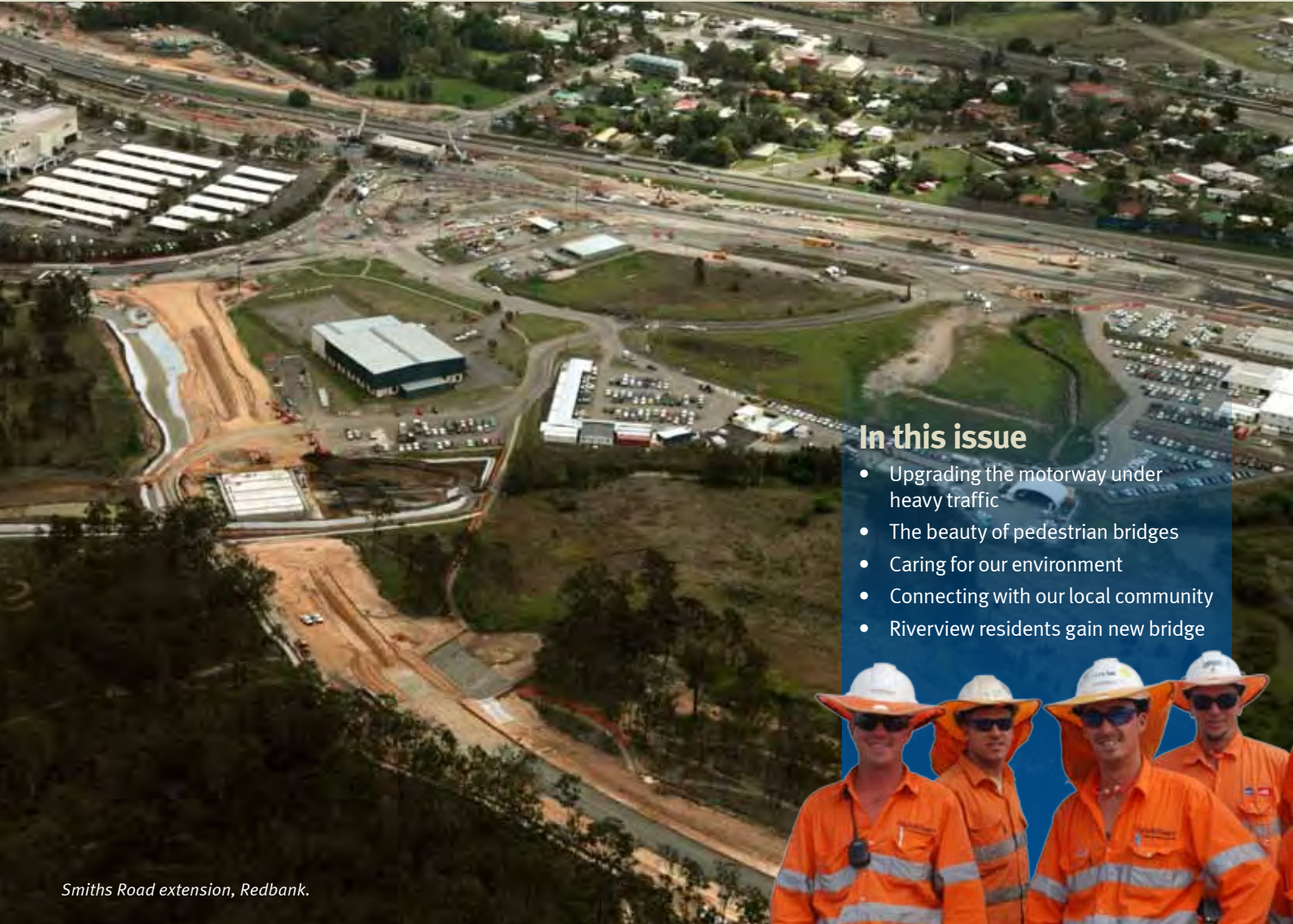
Smiths Road extension, Redbank.