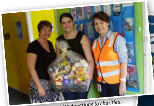
The Alliance also provides donations to charities...