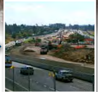
1 - Ipswich bound traffic before and after the Redbank switch in August.