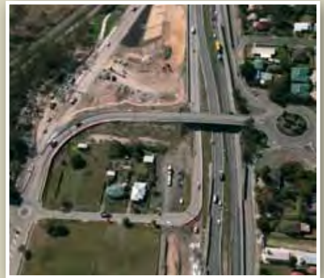
The old Tessman bridge will be replaced with a new pedestrian bridge.

The new Tessman Street pedestrian/cycle bridge will be in place by the end of the project in December 2012.