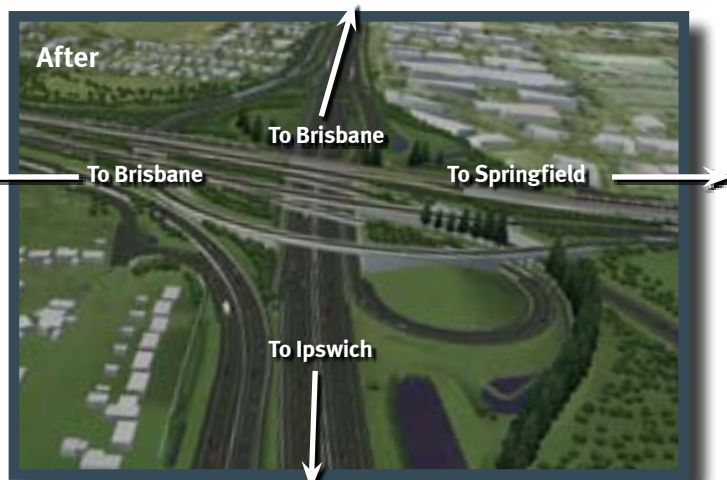
An artist's impression of the upgraded Centenary Highway Interchange