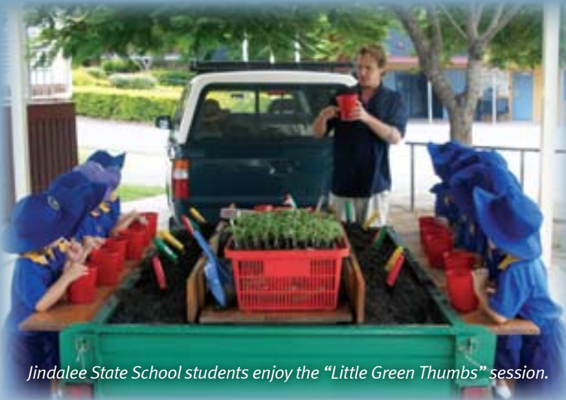
Jindalee State School students enjoy the "Little Green Thumbs" session.

Recognising the important role schools play in the local community, the project has also partnered with three local high schools, Centenary State High School, Forest Lake College and Glenala State High School in two programs, the Young Achievement Australia Business Skills Program and Enlighten Education.