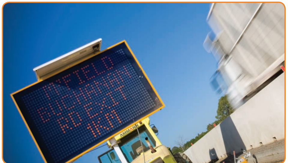
A VMS – variable message sign.

Main Roads uses state-of-the-art technology, including advanced communication and traffic flow systems to provide up-to-date information, help road users choose the right route to plan trips and clear road incidents as fast as possible.