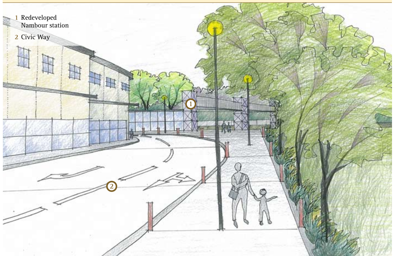
Artists's impression of the redeveloped Nambour station from the corner of Currie Street and Civic Way.