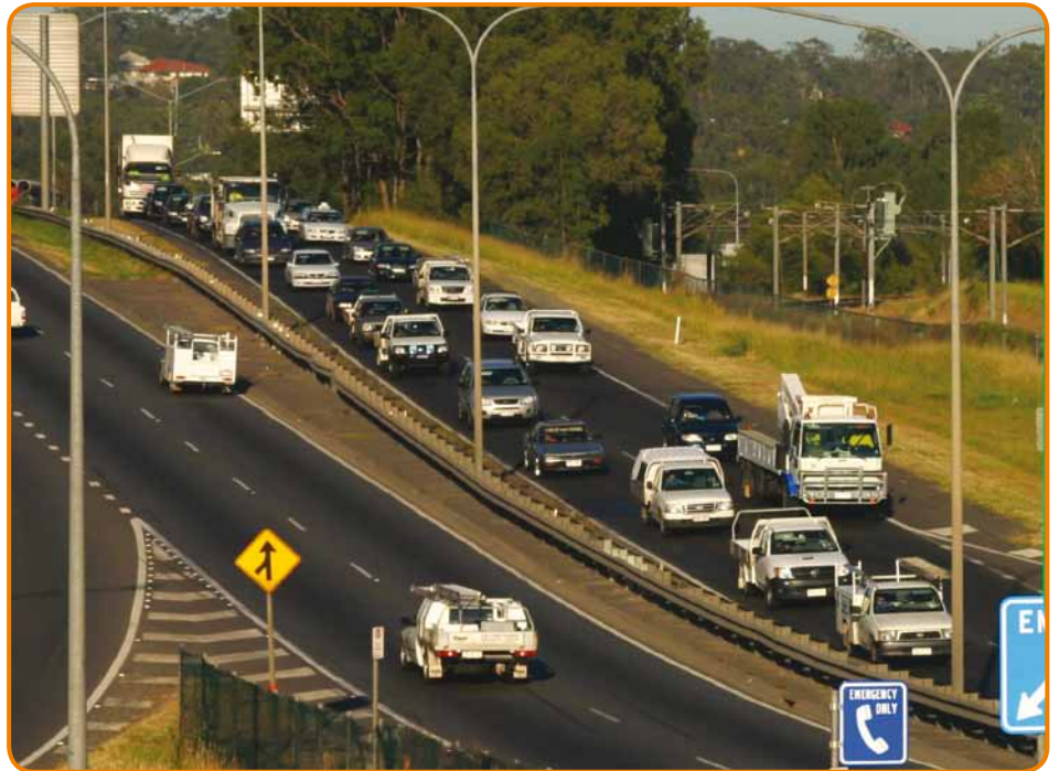
Traffic demands are increasing in the Western Corridor.

South east Queensland's population is projected to grow by over one million people in the next two decades. The Australian and Queensland Governments have agreed on the way forward for increasing the capacity of the Ipswich Motorway to meet projected traffic demands in this growth corridor. It's also important that the motorway serve its function in moving freight efficiently from interstate and other parts of Queensland to Brisbane and the port of Fisherman Island.