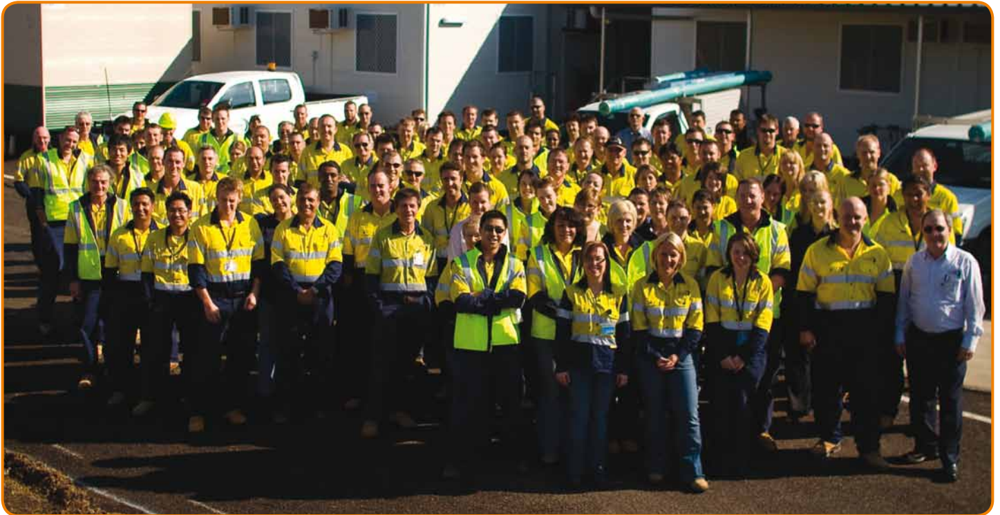
SAFELink Alliance team members.