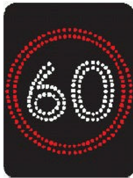
Figure 5.2a Example Speed limit

Where required, the sign will also be used to display lane control frames in accordance with the MUTCD.