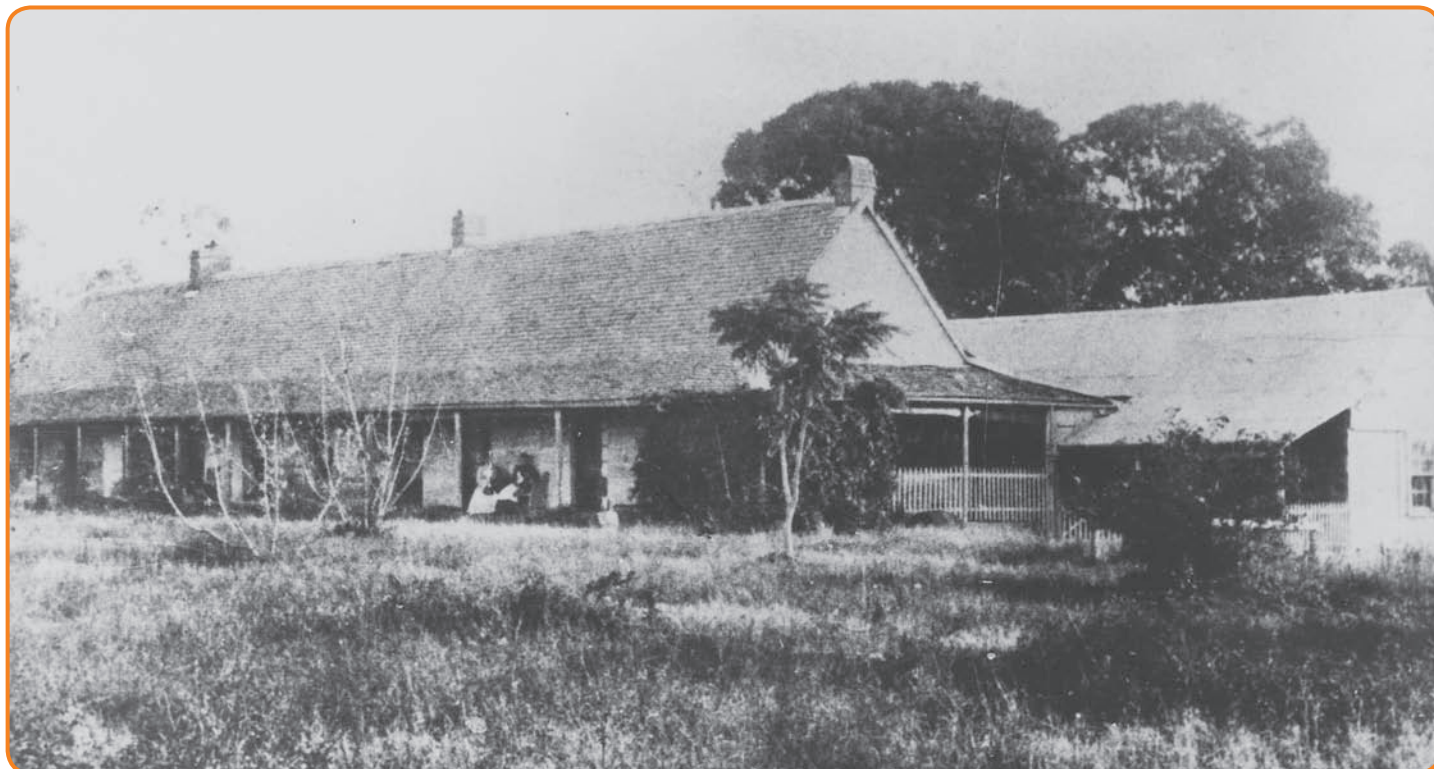
State Library of Queensland, image 21943