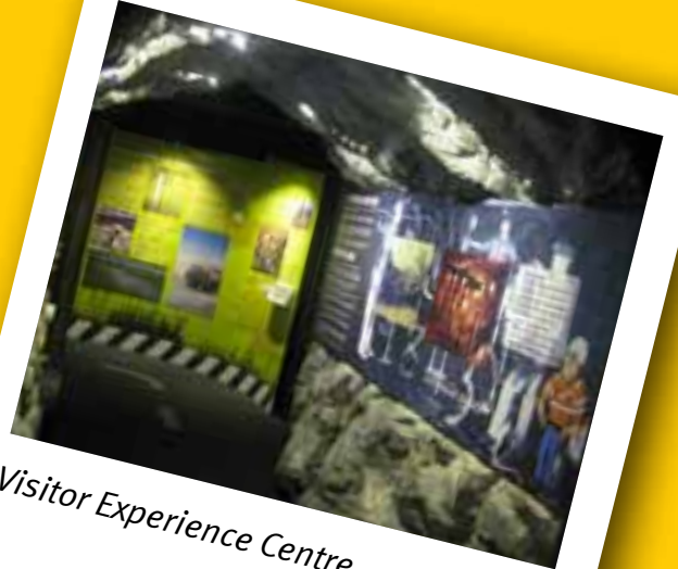
Visitor Experience Centre