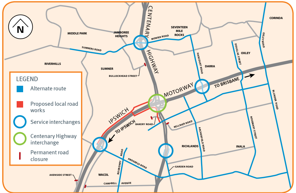
Service interchanges in the local road network are located at Harcourt Road, Progress Road, Sumners Road and Garden Road. Motorists and the community will be informed well in advance of all closures.

Access for the local road network will be available via service interchanges.