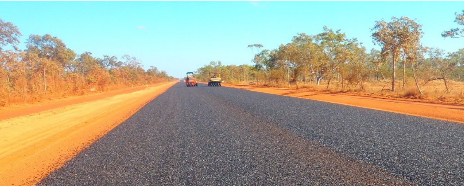
Figure 1: Sealing works on the Peninsula Developmental Road, Rocky Creek to Koolburra, in 2014