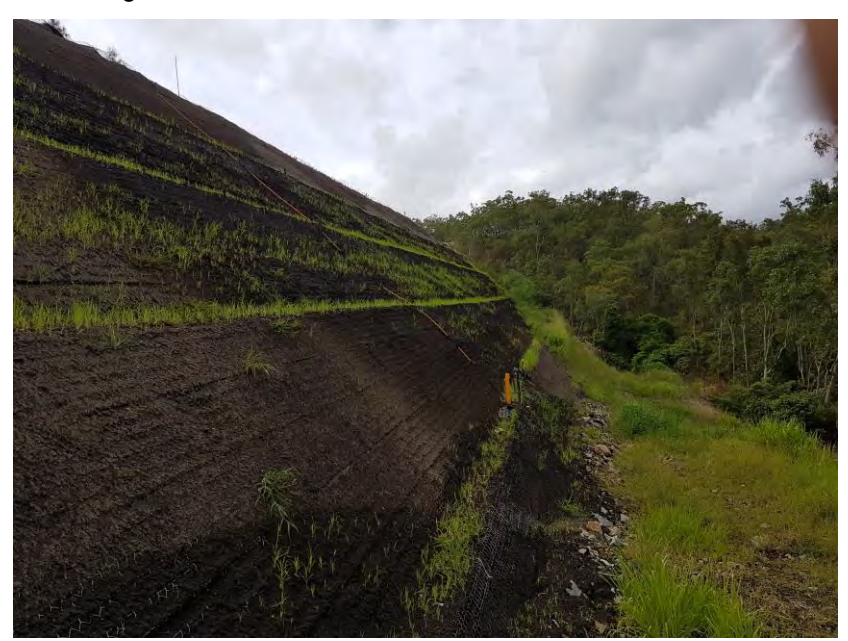
Figure 6: Permanent landscaping at reinforced earth embankment (REE 2)