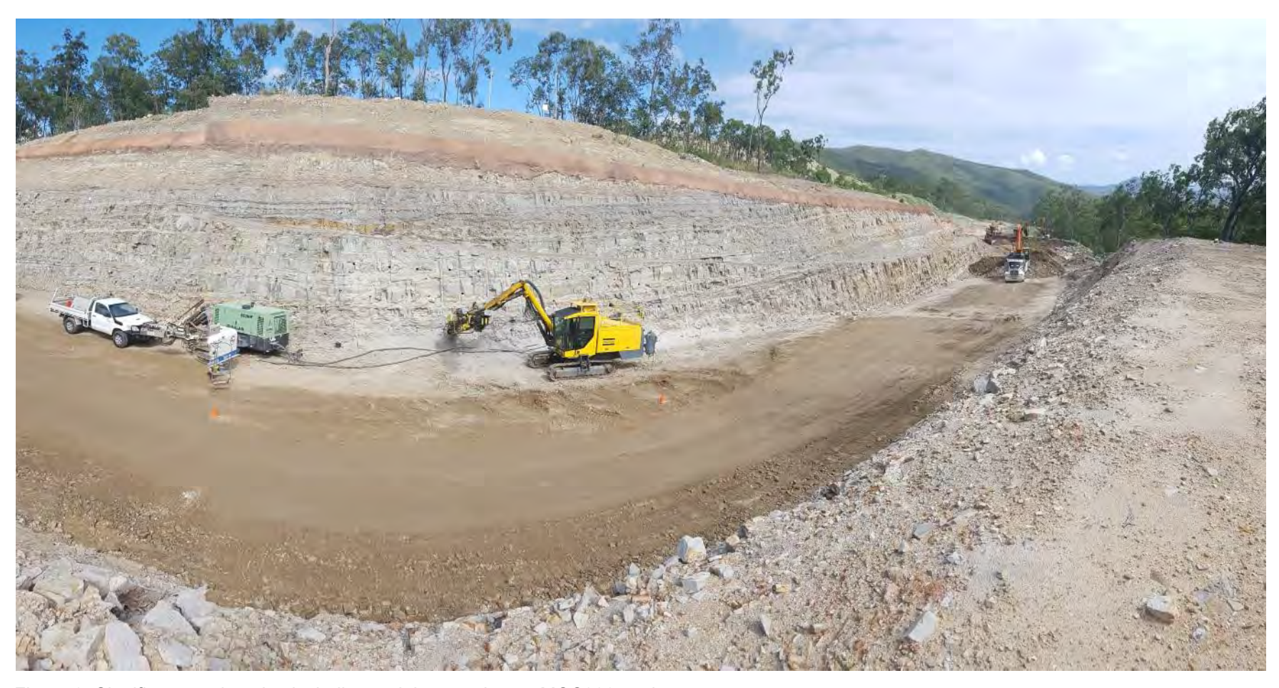
Figure 2: Significant earthworks, including rock hammering, at MCC002 cutting