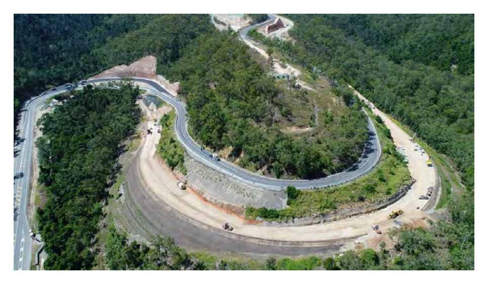
Figure 9: February 2018 drone footage of REE2 at the upper hairpin