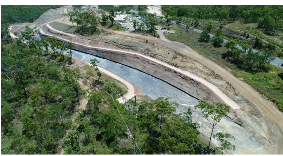
Figure 10: February 2018 drone footage of Cut 107 to the west