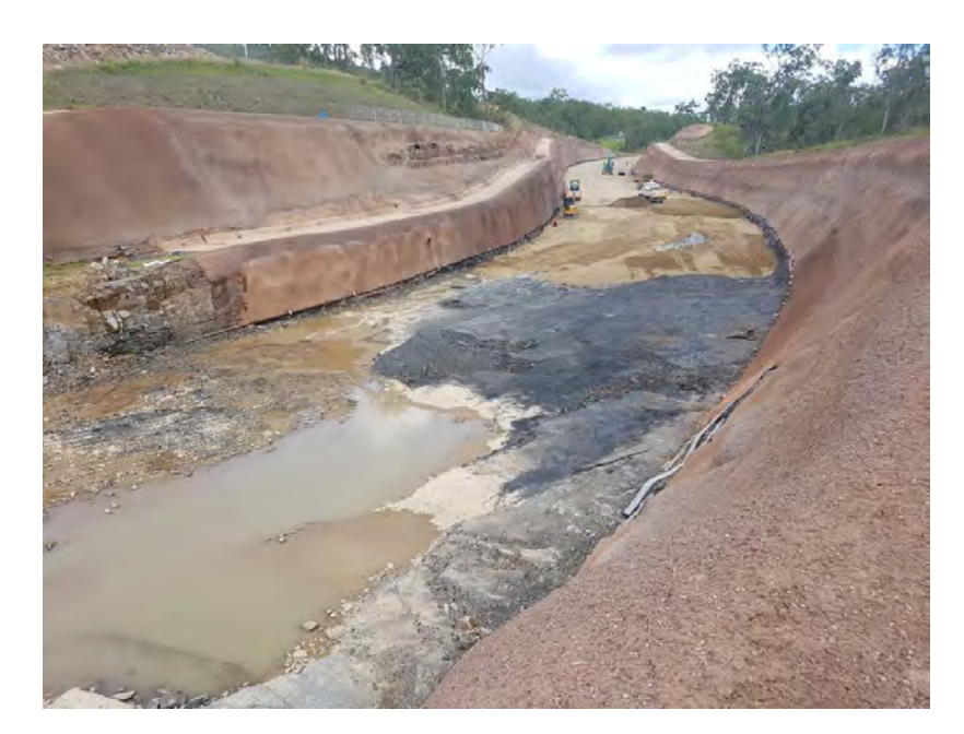
Figure 3: Shotcrete applied at the end of Cut 107