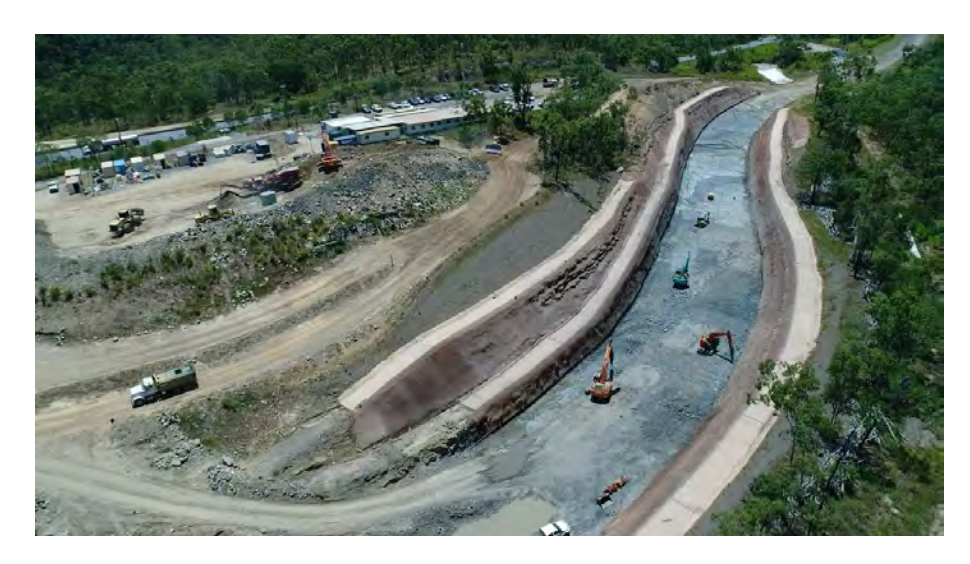
Figure 11: February 2018 drone footage of Cut 107 to the south