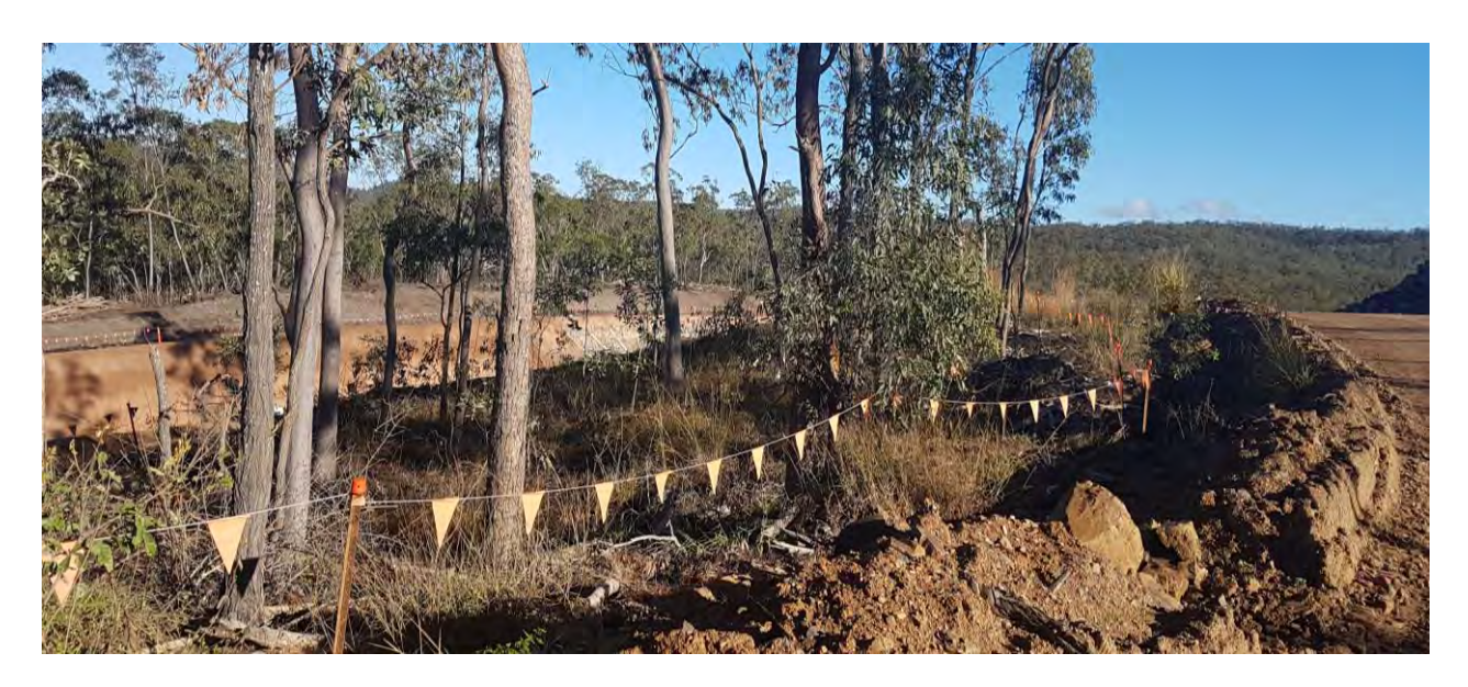
Figure 7: Retained vegetation within the project area