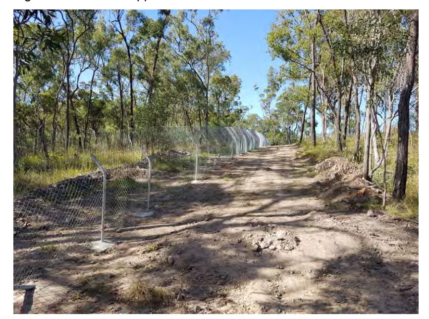
Figure 5: MC002 extension of fauna fence undertaken in February 2018