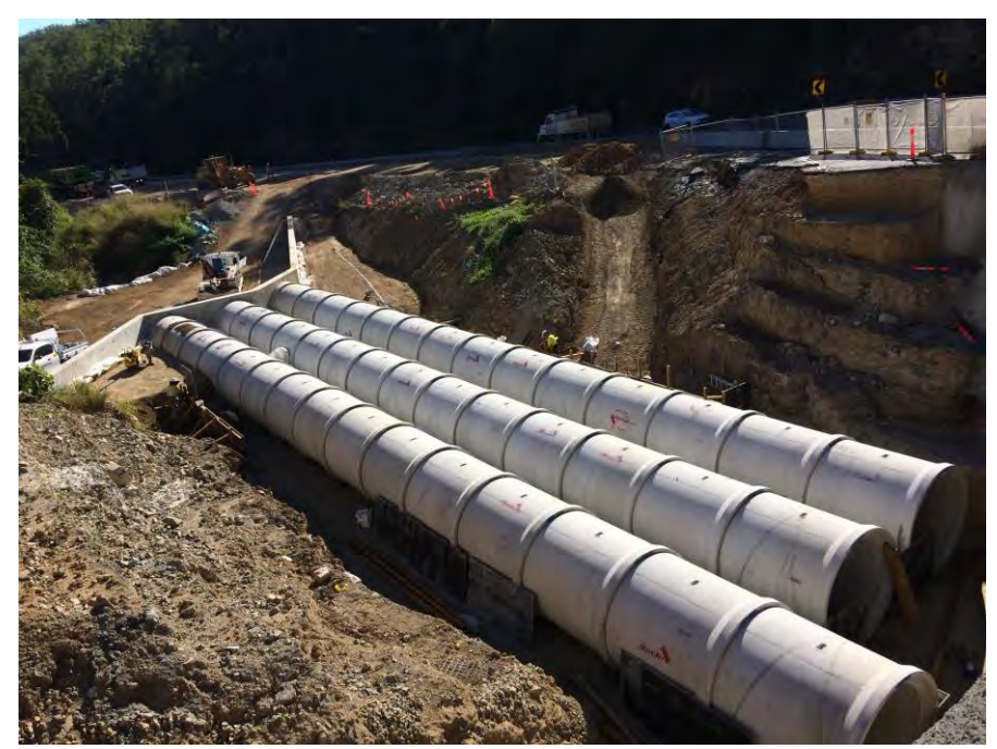
Figure 13: Culvert extension works at Cut Creek