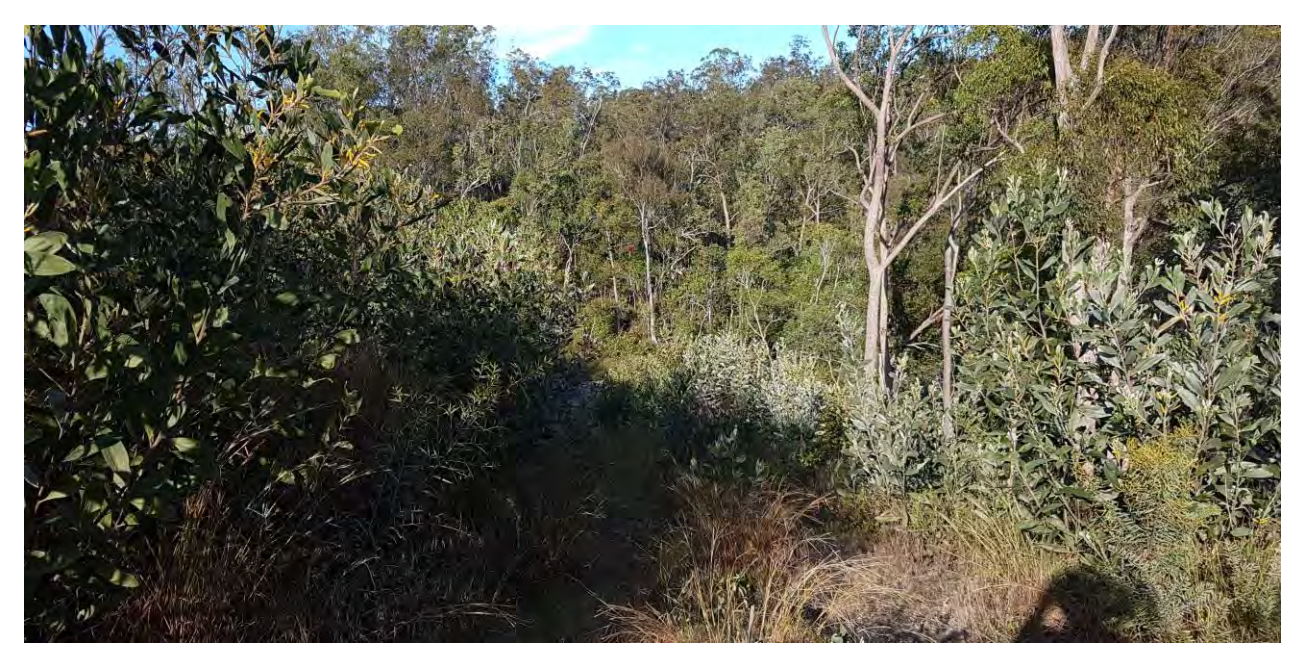
Figure 8: Vegetated batter at trial REE (landscaping undertaken in December 2015)