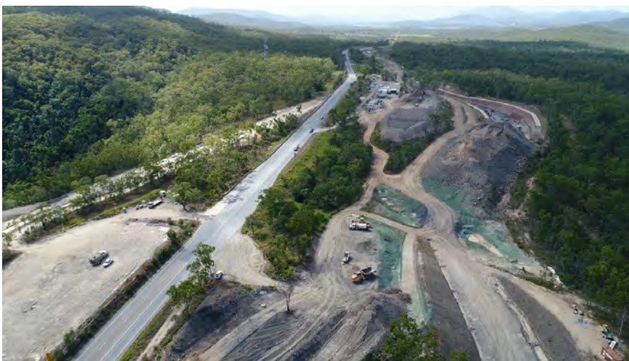
Figure 12: February 2018 drone footage of MC002 alignment, looking north