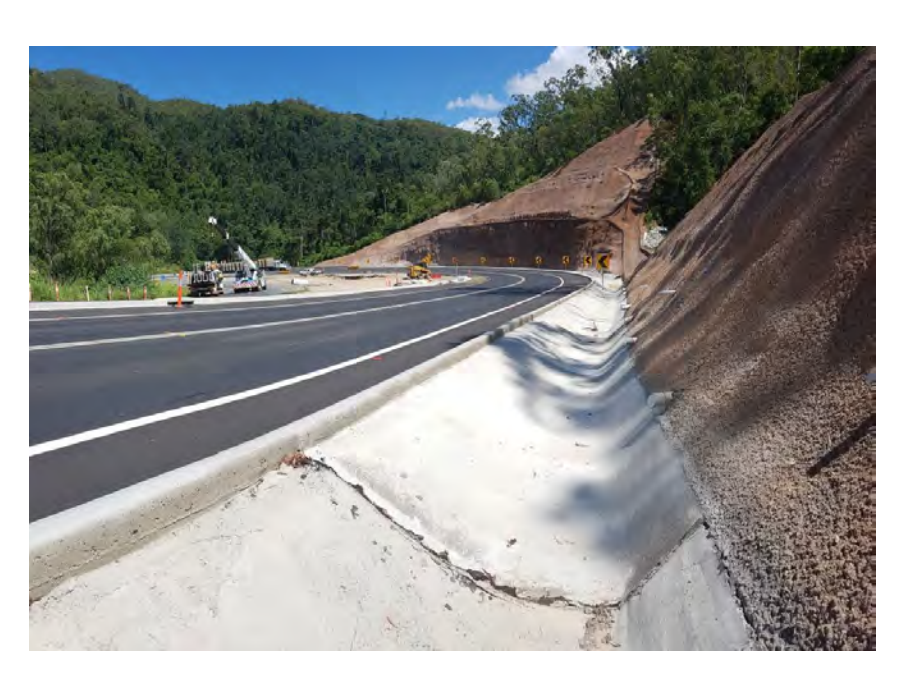
Figure 4: Permanent kerb and table drain works at Cut 215