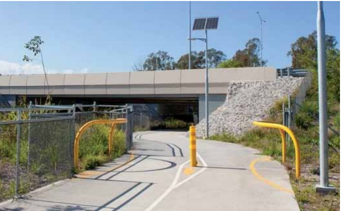
Example of dedicated cycleway