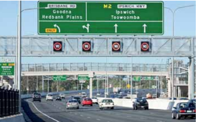
Example of completed motorway upgrade with variable speed limit signs