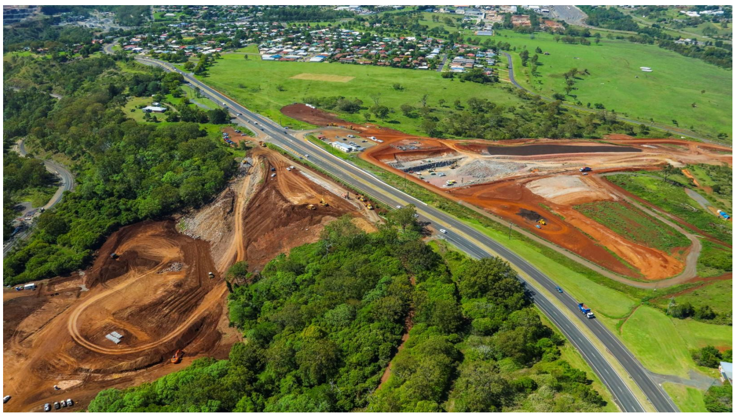
New England Highway, Mount Kynoch with excavation underway for the TSRC cutting, at left, and foundations being laid for twin arch bridges on the New England Highway, at right, where it will pass over the TSRC cutting.

A safer, faster link in the National Land Transport Network