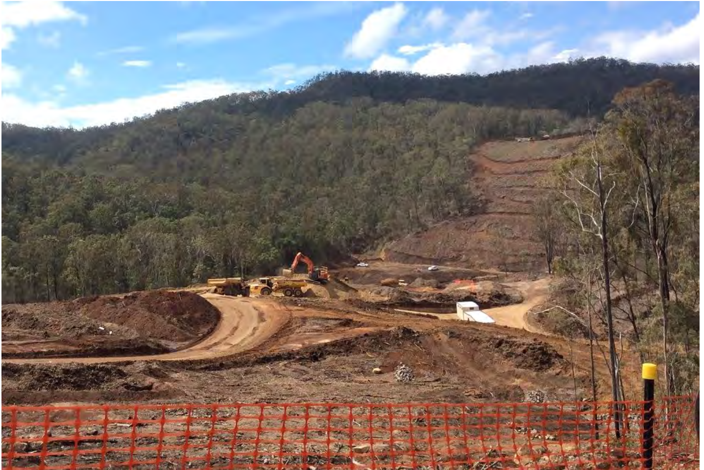
Excavation underway near Morleys Road underpass at Ballard, north-east of Toowoomba.

A safer, faster link in the National Land Transport Network