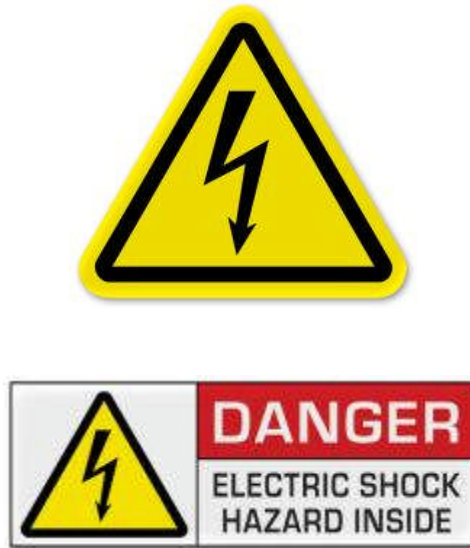
Figure 1 Warning Labels

Covers in other areas of the vehicle (including under the bonnet) must protect any exposed HAZV components to a protection rating of at least IP2X.