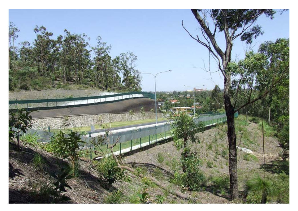
Figure C3-11: Fauna fencing integrated within the road landscape

Refer to the Departments Fauna Sensitive Road Design Manual for design guidelines of various types of fauna movement devices.