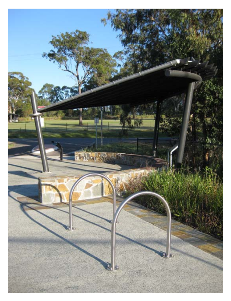
Figure C3-13: High degree of shade amenity provided at cycleway facilities