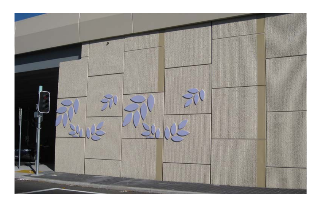
Figure C3-9: Retained soil system wall panels incorporating contextually sensitive urban design detailing and colour palette