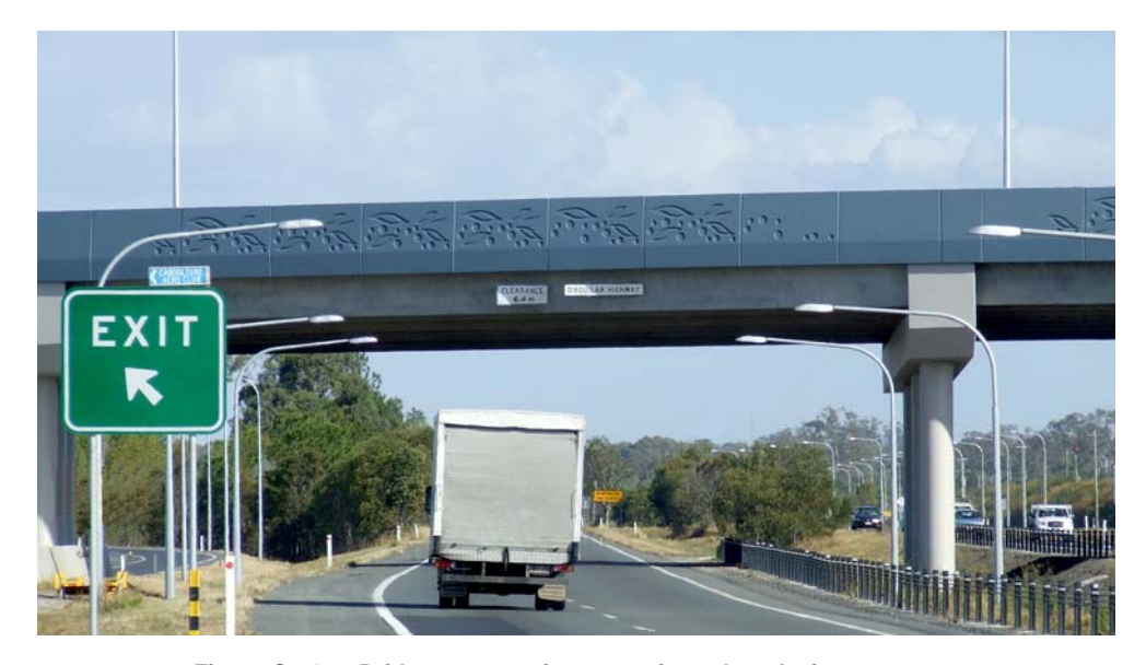
Figure C3-1: Bridge parapets incorporating urban design treatment