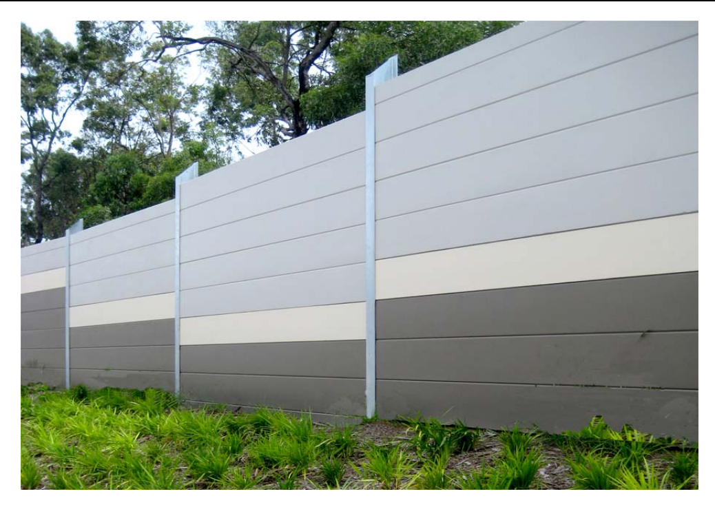
Figure C3-7: Colour and pattern in conjunction with material selection used in noise barriers design to create visual interest and express corridor themes

Careful consideration should be given to the use of transparent panelling due to the additional capital cost and as associated maintenance issues (shorter design life and breakage damage). Transparent panels should only be used where: