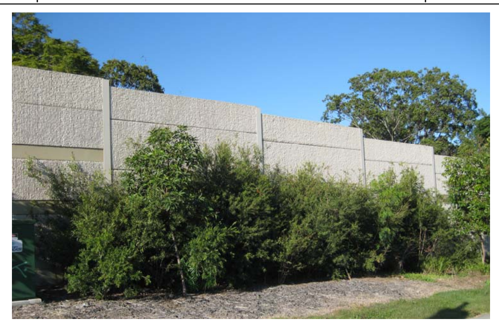
Figure C3-6: Buffer planting protecting noise barrier from vandalism and graffiti