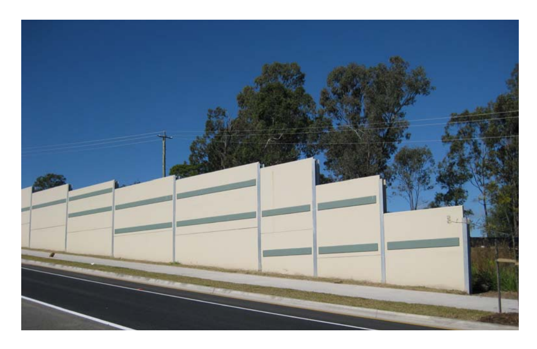
Figure C3-5: A stepped wall generating visual interest and views to landscape beyond

Where buffer planting to the frontage of fences cannot be achieved, these are typically are more susceptible to vandalism. Vegetation buffering of large exposed areas of fences with planting can assist in reducing opportunities for and incidence of graffiti, as it restricts access thereby acting as a deterrent. Vegetation buffering will also help screen graffiti damage that does occur, reducing its visual prominence and the need to repair under maintenance. Therefore a dense screen of vegetation to each side of noise fences should be prioritised to the greatest extent possible for improved aesthetic outcomes and to mitigate maintenance intervention.