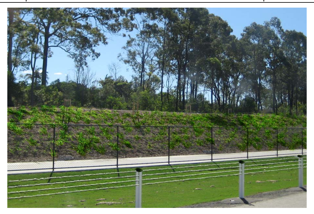
Figure C3-10: Black fencing visually blends into the landscape background