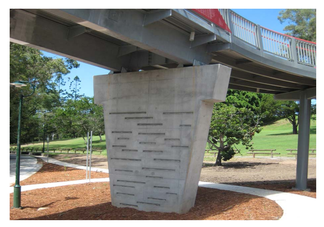
Figure C3-2: Tapered and textured piers create a visually recessive structure within the road landscape