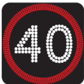
Figure 5.2© – Type 3 – School Zone Speed Limit sign Speed Activated – TC1786