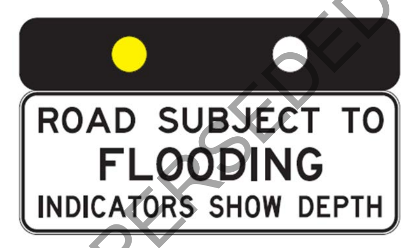
Figure 9: RFMS signage showing advanced warning flooding warning lights - TC1768

Frangible post or slip base construction shall be used in high speed environments for mounting the signs. The decision to use slip base or frangible posts shall be made by an engineer with the appropriate RPEQ qualification.