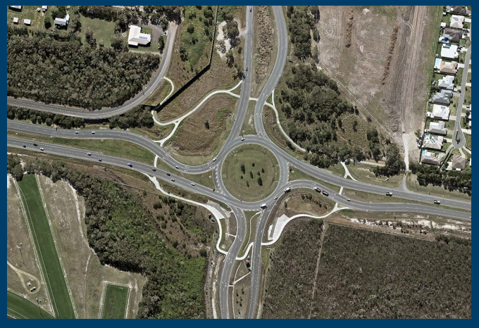
Aerial image of the current roundabout at Caloundra Road, Kawana Way Link Road and Bells Creek Arterial Road.

To request a hard copy survey to be posted to you, please contact the project team via the details on the back page of this newsletter.