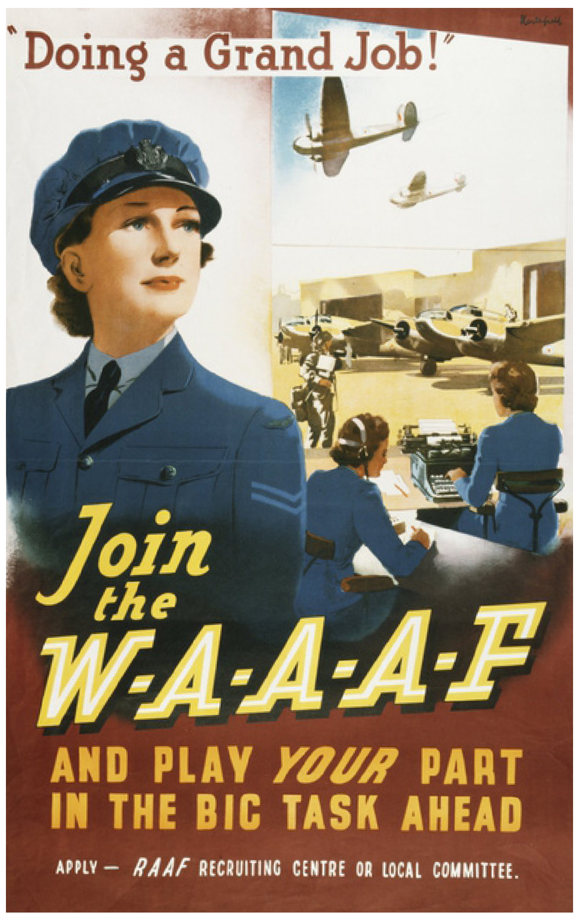
Above: Australian Second World War recruitment poster by James Northfield.