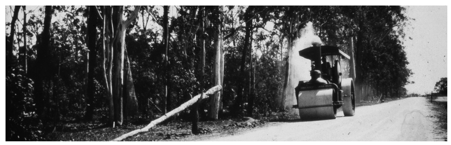
Section\ under\ construction\ steam\ roller\ operating\ on\ dirt\ section\ of\ Redcliffe\ Road.

Anzac Memorial Avenue (or Anzac Avenue as it is also known) is now heritage listed, having been added to the Queensland Heritage Register in 2009.