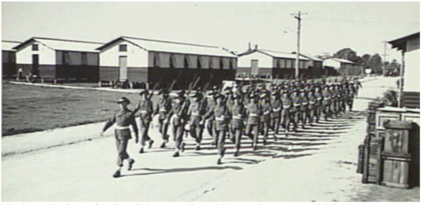
Kalinga, Queensland, Australia. 1945-07. Troops of the special wireless group marching through their camp area.

To mark the Anzac Centenary, this commemorative publication In roads to defence , acknowledges the role played by transportation in Queensland's defence history during the First and Second World War. It is a tribute to the men and women of the department and its previous iterations who served in these wars, both at home and abroad.