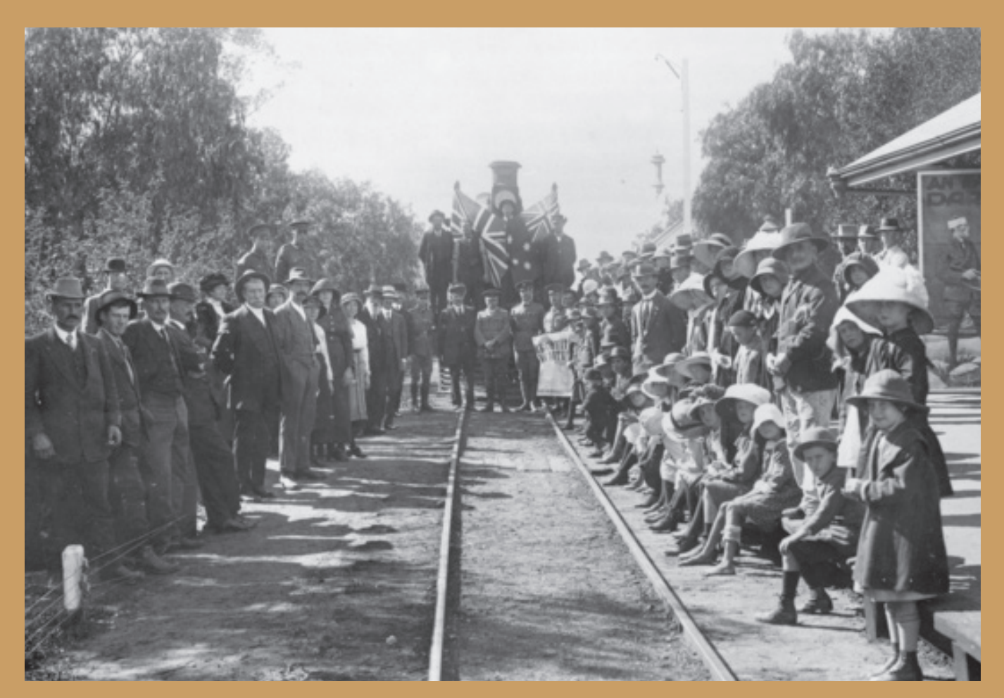
Wallumbilla, Queensland. c. 1916. A touring recruiting train at the railway station with some of the town's citizens. (Donor Queensland Recruiting Committee) Source: www.awm.gov.au/collection/Ho2211A

As enlistment rates declined, recruiters employed a variety of methods to increase the numbers of volunteers such as press advertising, billboards, and even recruitment trains. To commemorate the Anzac Centenary, a re-enactment of a recruiting train was held in 2015 travelling from Winton to Brisbane in time for the Anzac Day service.