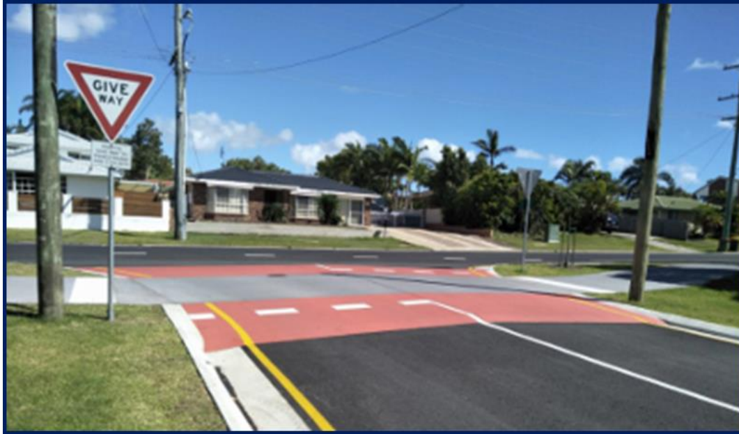
Caption: Example of a raised priority crossing for a shared pathway