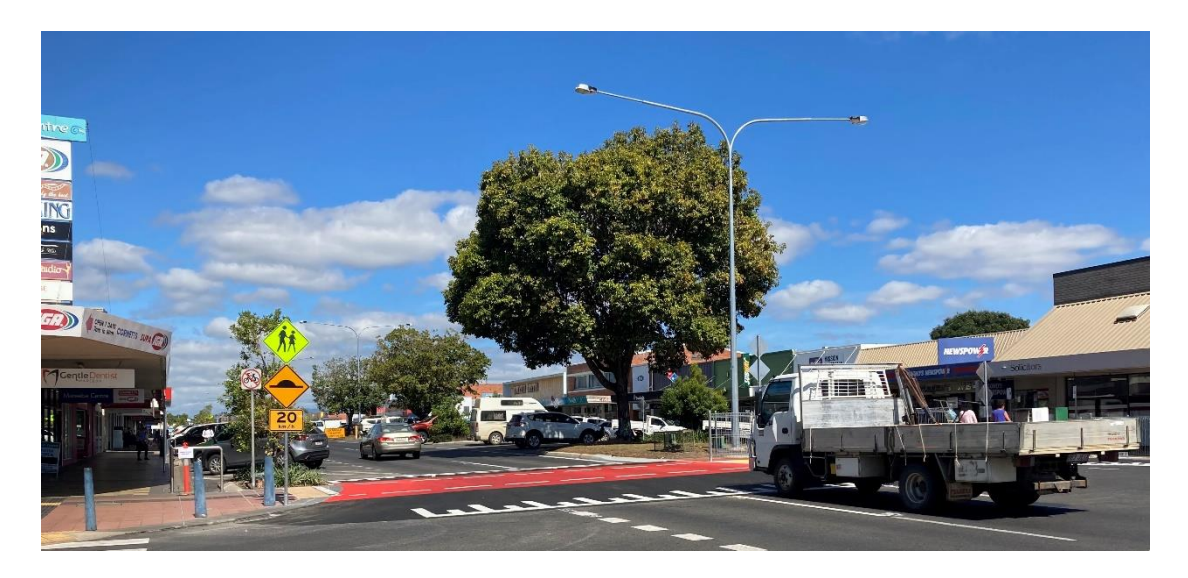
Raised pedestrian facility on Byrnes Street in Mareeba.

The program of road safety upgrades is jointly funded by the Australian and Queensland governments and works have been carried out at several locations across Far North Queensland.