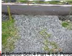
Part Refuse Sch.4 Part 4 s.6 Personal information Palmerston Dr_After.jpg

Dear Mr [Redacted] Part Refuse Sch.4 Part 4 s.6 Personal information