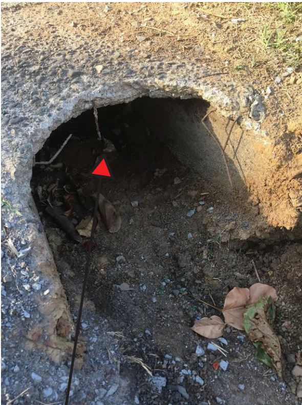
Rusty reinforcing shows old break