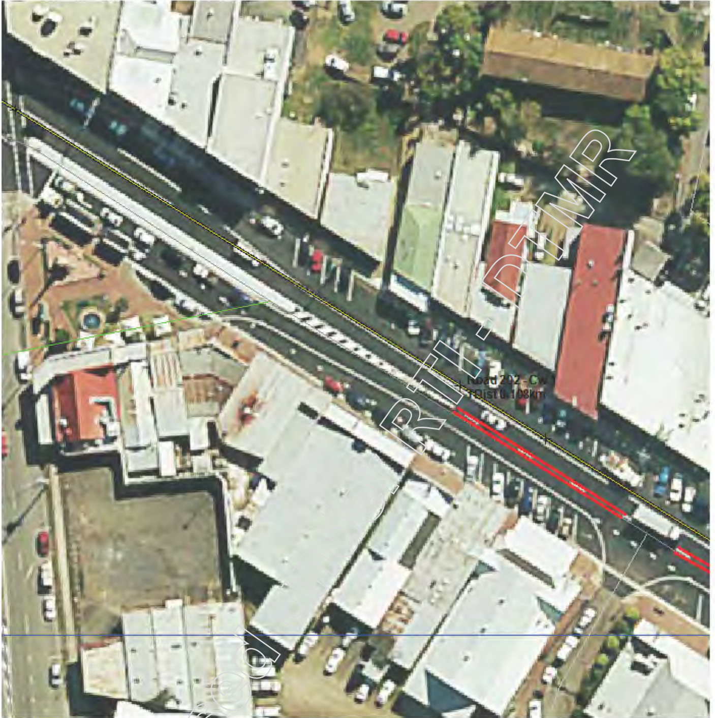
Double lines sketch