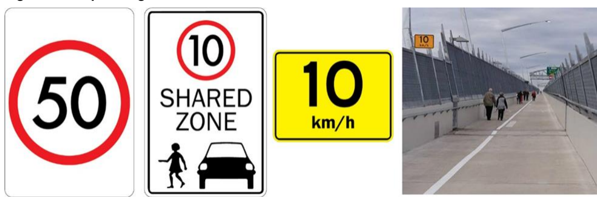
Figure 2.1 - Speed signs in current use

The two signs on the left are regulatory (enforceable) speed signs which apply to both the road and the road-related area (adjacent paths). The centre right sign is an (unenforceable) advisory speed sign. This type of sign is preferred for indicating advisory speeds (photo right). Where a regulatory speed limit is not signed, the default speed limits apply – 50 km/h in built-up areas and 100 km/h outside built-up areas.