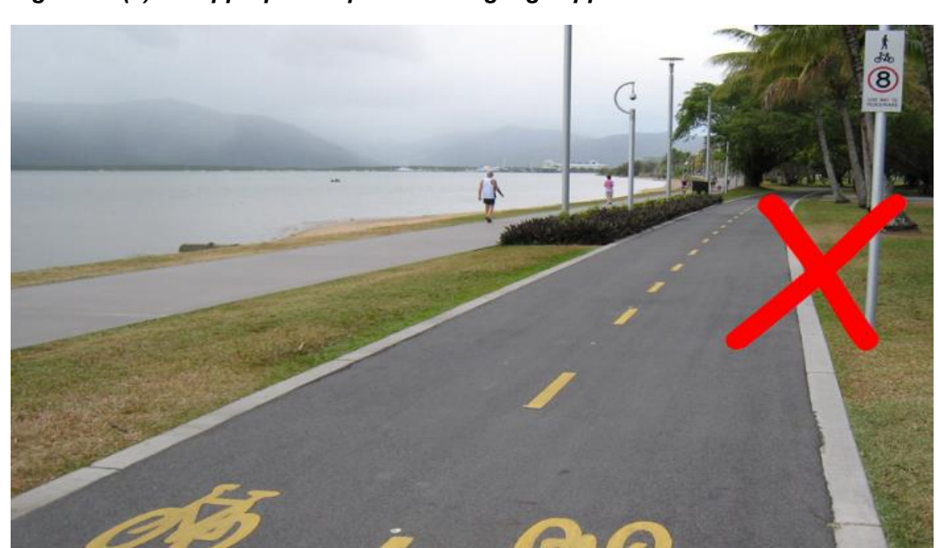
Figure 1.2(a) – Inappropriate speed limit signage application

Though the path on the right in this photo has been line marked as a bicycle path, the modified R8-2 regulatory sign declares it as a shared path with an 8 km/h speed limit. The adjacent path on the left is designed and signed for pedestrian-only use. Cairns, QLD.