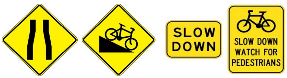
Figure 3.6 - Warning advisory signage recommended for use on paths in Queensland

Left to right: W4-3 Path Narrows (also W4-3 Narrow bridge); TC9605 Steep descent – W4 signs and TC9605 to be 450 mm square; TC1608 (300 mm wide) SLOW DOWN – used in conjunction with other diamond shape warning signs); TC1592-2 SLOW DOWN FOR PEDESTRIANS.