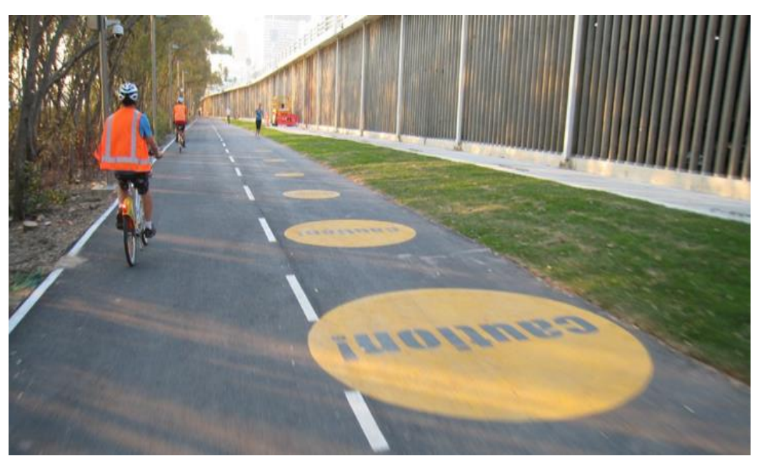
Figure 1.2(b) - Effective use of pavement markings to manage speeds

Though the path on the right in this photo has been line marked as a bicycle path, the modified R8-2 regulatory sign declares it as a shared path with an 8 km/h speed limit. The adjacent path on the left is designed and signed for pedestrian-only use. Cairns, QLD.