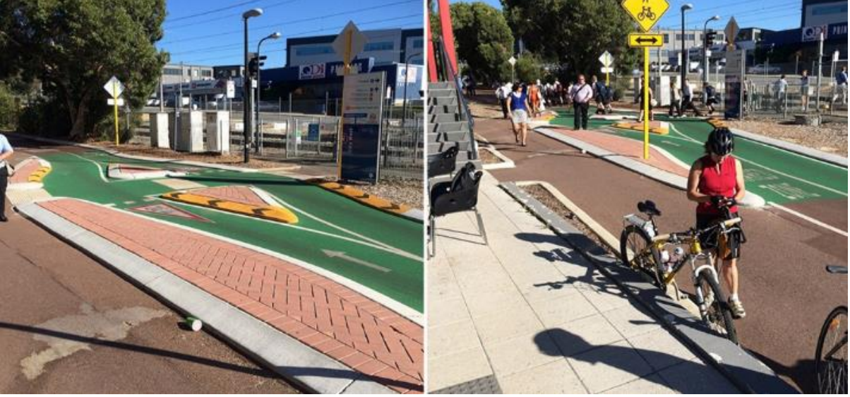
Figure 3.5(c) - Shared path slow point treatment at railway station access point

Distinctive pavement markings have been added to the pavement of this curving shared path as it enters an underpass on a downhill slope. Normanby Pedestrian Cyclist Link, Brisbane, QLD.