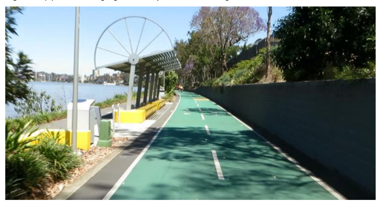
Figure 3.1(b) - Use of segregation and pavement markings to minimise conflict

During morning and evening peak periods this path is heavily used by people riding bikes and people walking. To minimise conflicts and improve user amenity, the path has been widened into separate bicycle and pedestrian paths. Bicentennial Bikeway, Brisbane QLD.