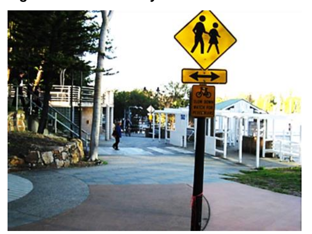
Figure 3.3 - Path safety issues due to broader design issues exacerbated by speed

As bicycles are vehicles of momentum, riders may coast quickly down hills, using the momentum built up from prior physical effort to travel further with minimal effort.