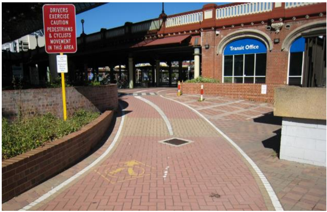
Figure 3.5(a) – A shared path adjacent to Perth central railway station

The following section demonstrates some examples of 'best practice' speed management, using the path speed limiting devices listed in the department's Road Planning and Design Manual Volume 3, Part 6A.