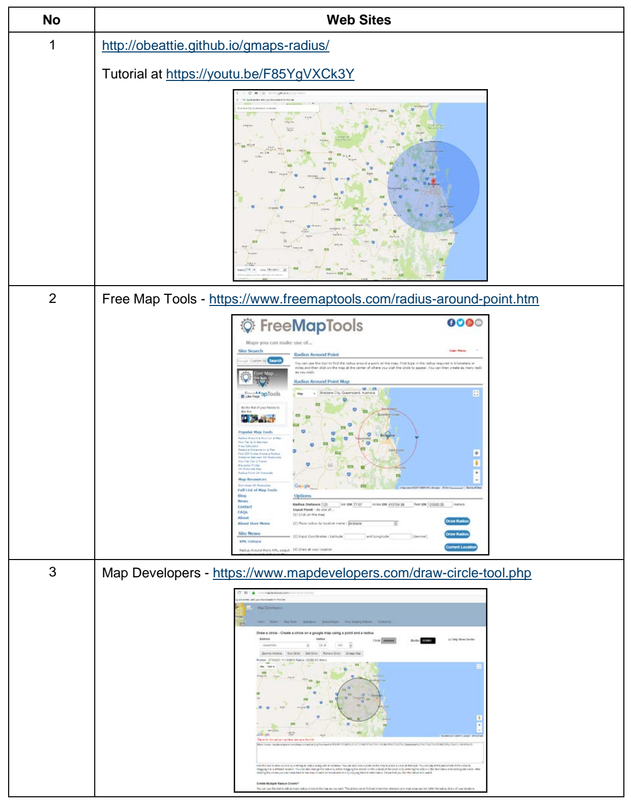
Table 15 – Drawing radius around a point

There are a number of mapping tools available to assist in identifying a 125 km radius from a point on a map. Three tools are shown in Table 15.