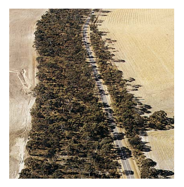
Figure 4.2 Remnant habitat corridor preserved within road reserve (West Australian wheat belt)

vulpecula ), Koala ( Phascolarctos cinereus ), and the Feathertail Glider ( Acrobates pygmaeus ), were also recorded in the roadside corridor. Suckling concluded that, other than incidental use by the Koala, the remaining three species probably use the corridor as a regular movement pathway.