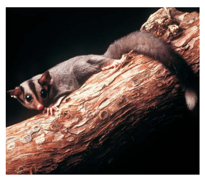
Figure 4.3 Sugar Glider