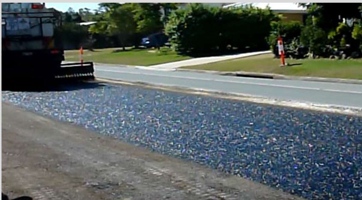
Figure 8.6.2 – C170 bitumen bond coat being sprayed on a prepared pavement surface

As a guide, the bitumen bond coated surface shall have a 'mirror' effect, which can be observed and assessed by the Administrator.