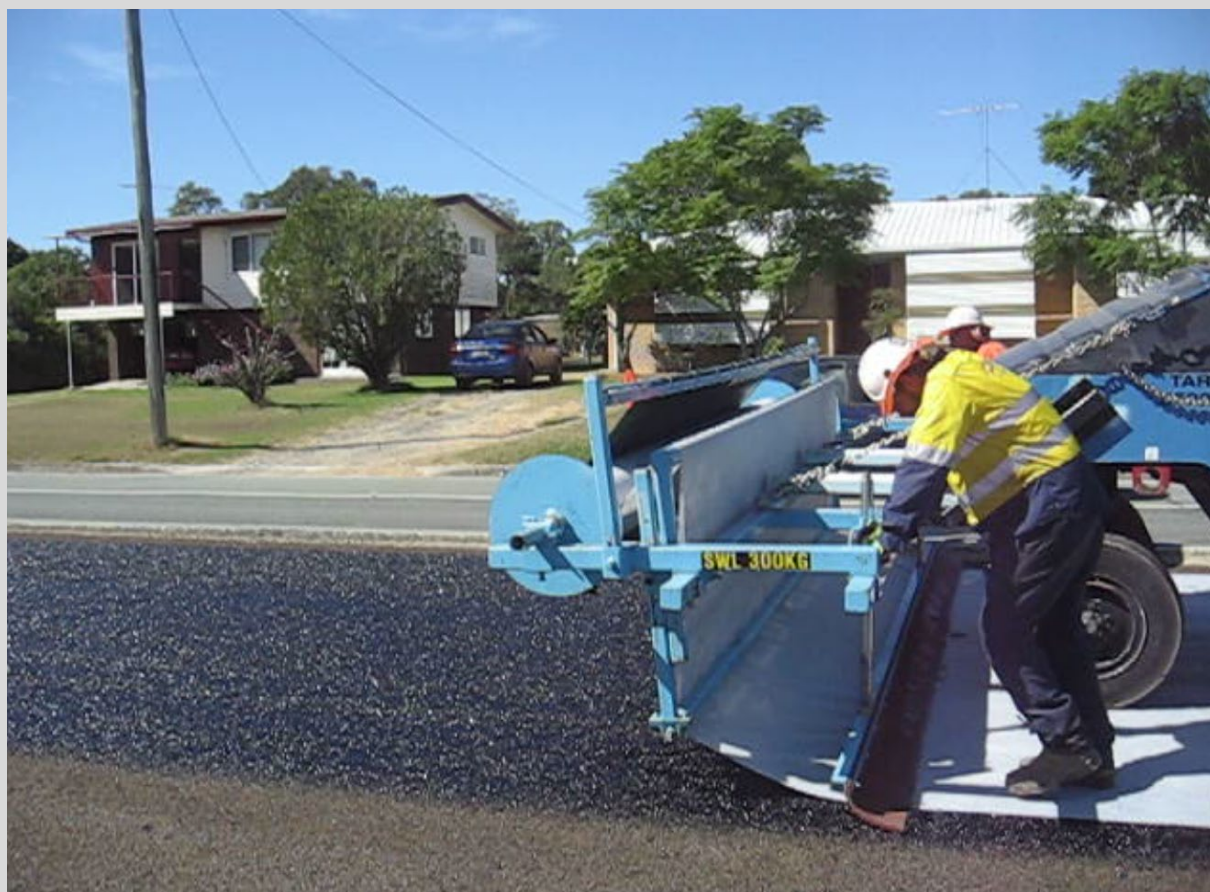
Figure 8.7.2(a) – Placement of geotextile using application frame attached to multi tyred roller

Brooms, brushes and/or rubber bars attached to the application frame are used to help press the geotextile into the surface.