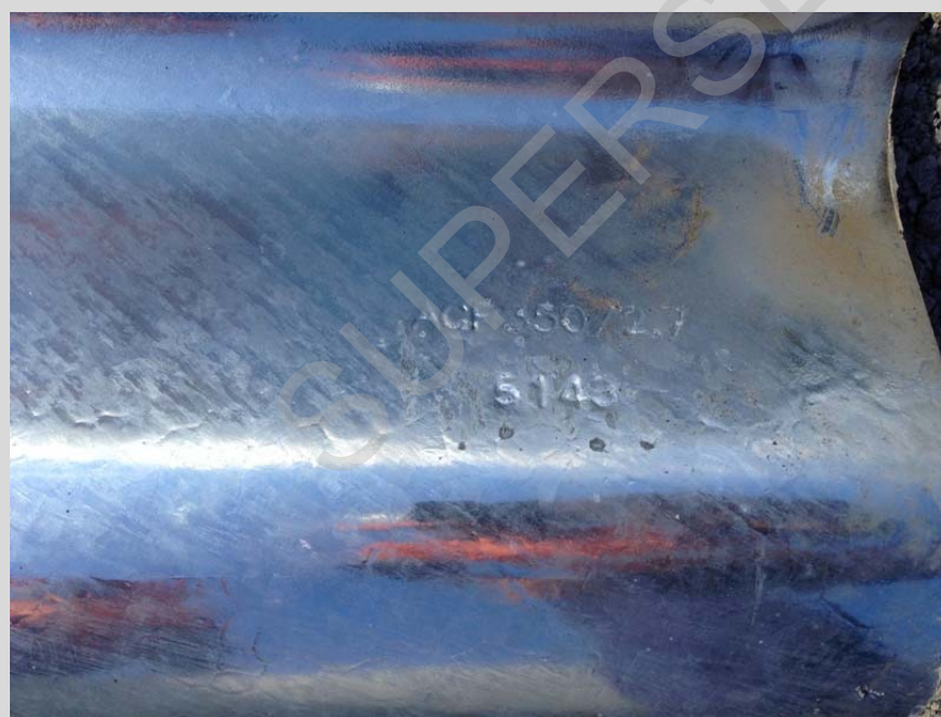
Typical view of the hard stamped details on the guardrail panel

Materials test certificates shall comply with the requirements of Clause 20.4.5.