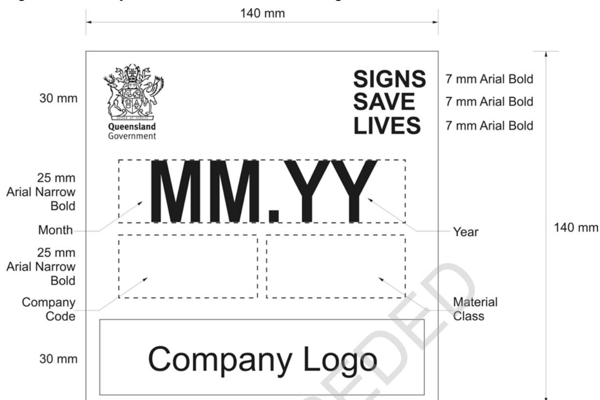
Figure 13.4.10 –Layout and minimum dimension of sign label

The markings detailed in above shall be black. The lettering in (b), (c) and (d) shall be 25 mm high and located so as to be visible after the sign is erected and not in a position likely to be obscured by stiffener rails or mounting posts. The legend described in (e) shall be located next to the corporate logo in a clear location and shall not exceed the height of the logo.