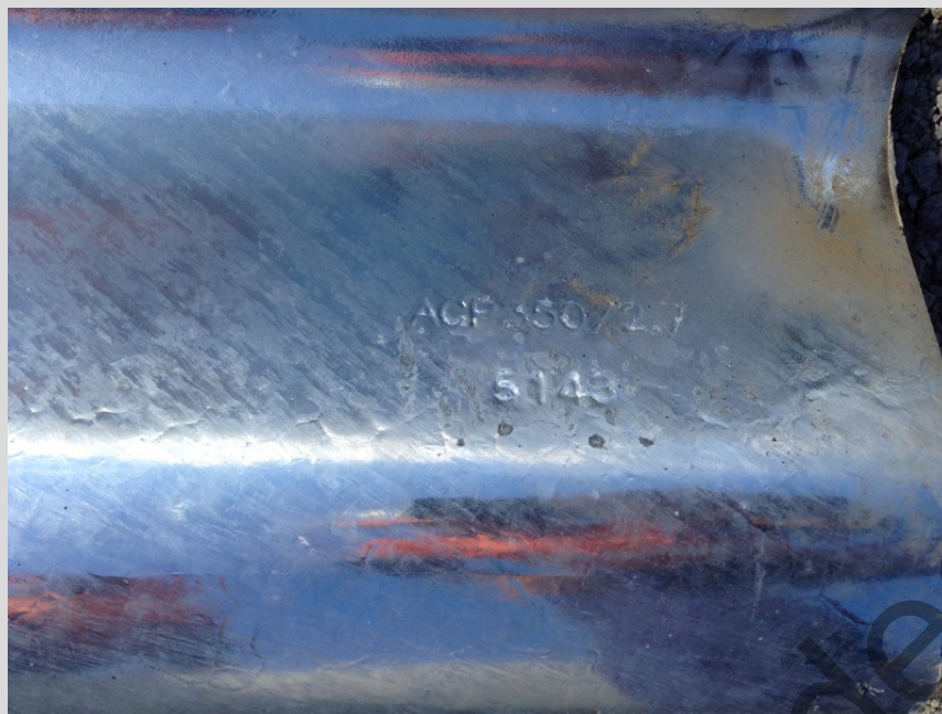
Typical view of the hard stamped details on the guardrail panel

Materials test certificates shall comply with the requirements of Clause 20.4.5.