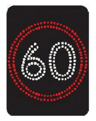
Figure 8.1.1.1(b) – Lane use symbols