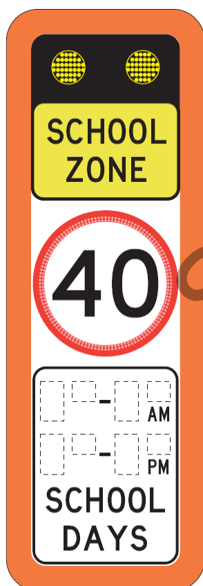
Figure 5.2(a) – Type 1 – Enhanced School Zone Speed Limit sign – TC1783

Three types of school zone speed limit signs are described in this Technical Specification and the types are shown in Figures 5.2(a), 5.2(b), 5.2(c) following. For sign detail, see the relevant TC signs at TC Signs webpage.