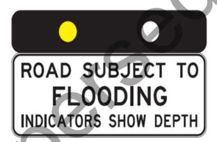
Figure 9(b) – Roadway flood monitoring system signage showing advanced warning flooding warning lights – TC1768 and TC2316

Figure 9(a) – Roadway flood monitoring system signage showing advanced warning flooding warning lights – TC1768 and G9-21-1