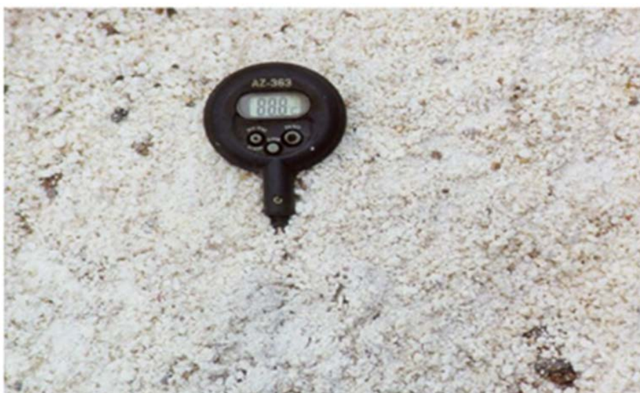
Figure 8.7.5.3 – Checking completion of slaking with temperature probe

The results of the spot checks performed on the slaked quicklime shall be included in the Contractor's quality records (refer Clause 9.5). The frequency of the spot check testing shall be as per Clause 1.2 in the Annexure MRTS07A.1. Where not so stated in the Annexure, spot checks on the slaked quicklime shall be undertaken at 25 m intervals selecting at the thickest area. Hold Point 6