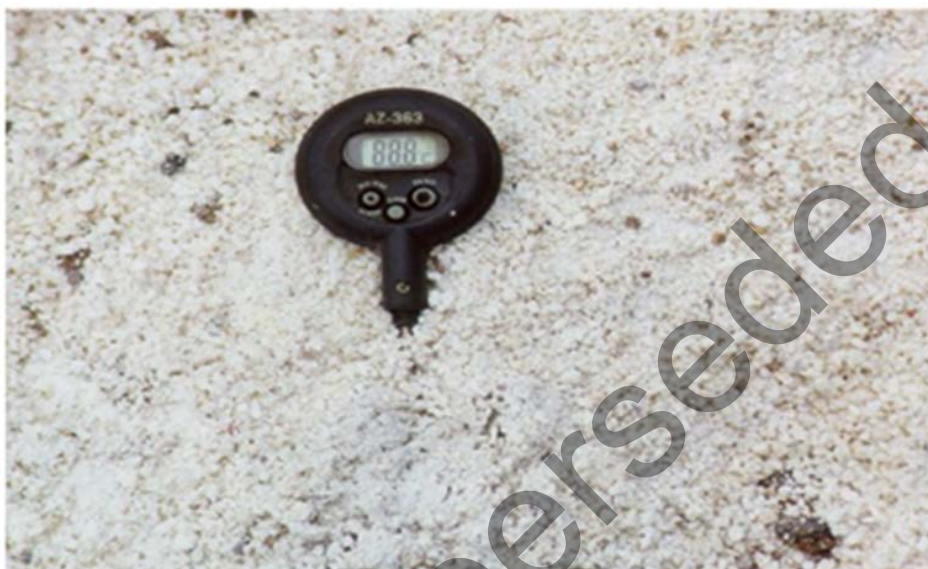
Figure 8.7.5.3 – Checking completion of slaking with temperature probe

The results of the spot checks performed on the slaked quicklime shall be included in the Contractor's quality records (refer Clause 9.5). The frequency of the spot check testing shall be as per Clause 5.4 Hold Point 6