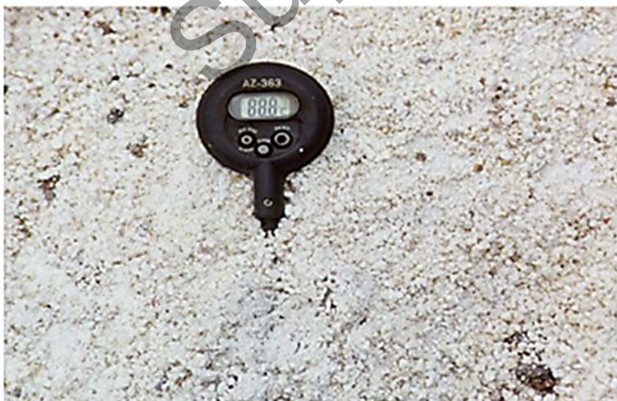
Figure 8.7.5.3 – Checking completion of slaking with temperature probe

The results of the spot checks performed on the slaked quicklime shall be included in the Contractor's quality records (refer Clause 9.5). The frequency of the spot check testing shall be as per Clause 5.4 Hold Point 6