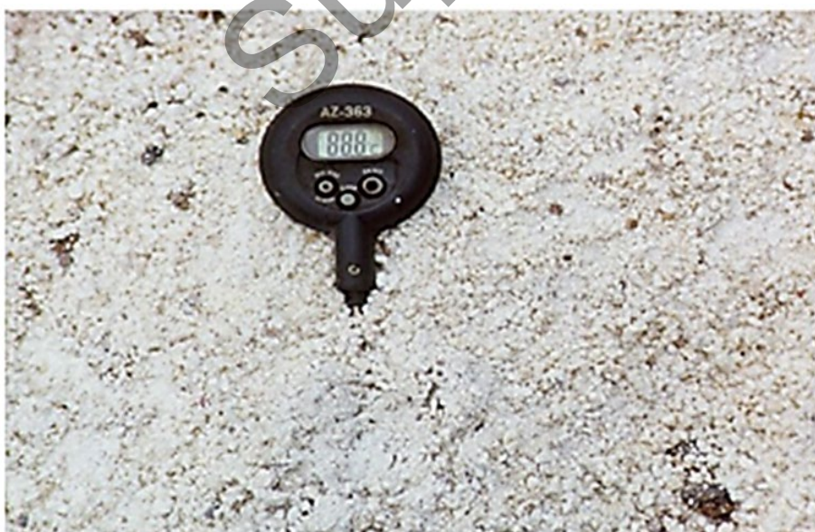
Figure 8.7.5.3 – Checking completion of slaking with temperature probe

The results of the spot checks performed on the slaked quicklime shall be included in the Contractor's quality records (refer Clause 9.5). The frequency of the spot check testing shall be as per Clause 5.4 Hold Point 6