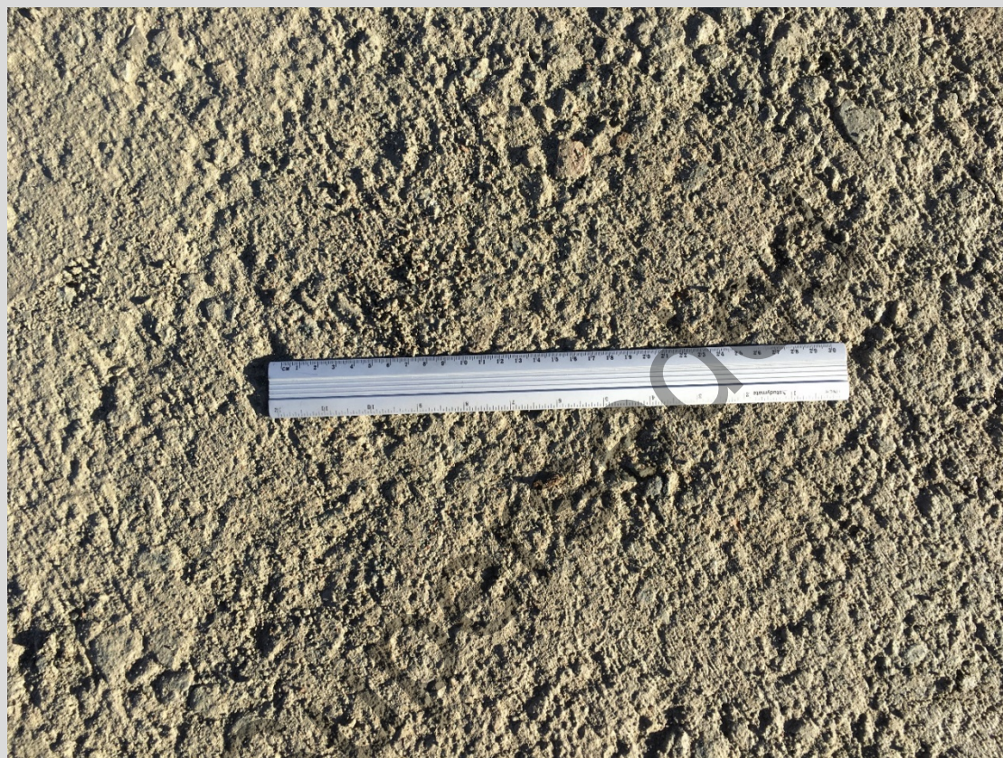
Figure 8.2.8.2 – Example of acceptable hard-cut surface

Unless the overlying layer is being constructed in the same work shift, a cement slurry (refer Clause 6.4) shall be applied to the hard-cut surface prior to placing the next lightly bound pavement layer.