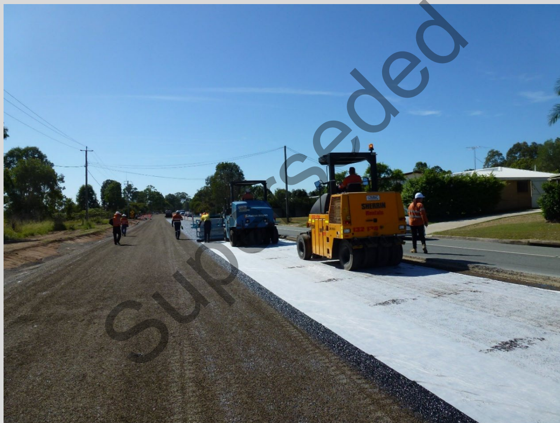
Figure 8.7.2 – Installation of geotextile using application frame attached to multi-tyred roller

Manual hand installation shall be carried out only in areas where it is impractical to use machinery.