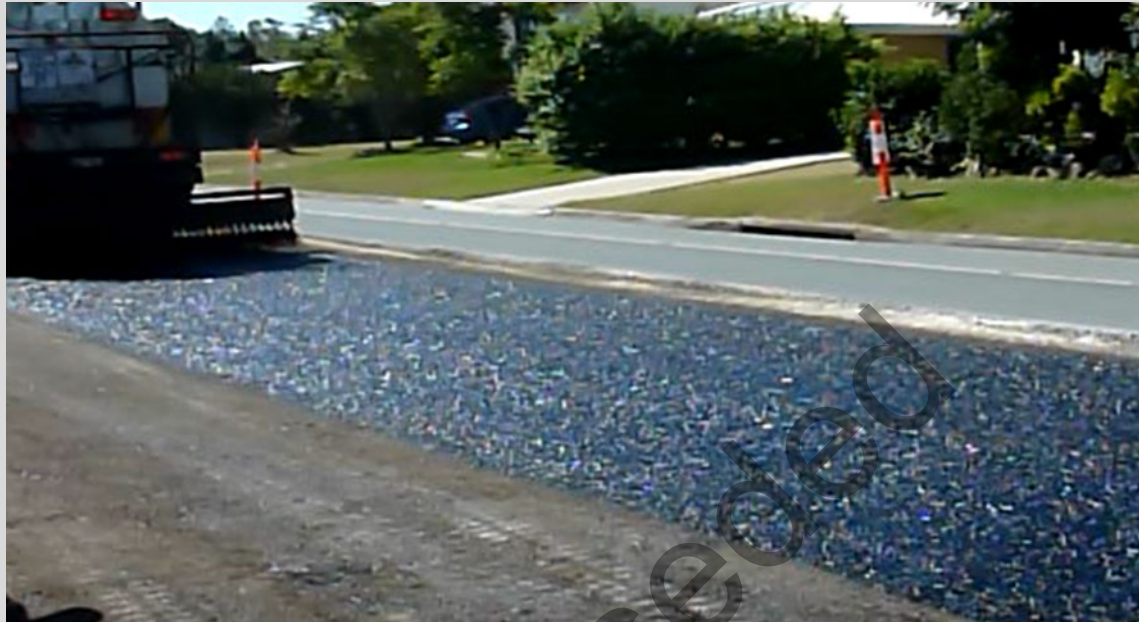
Figure 8.6.2 – C170 bitumen bond coat being sprayed on a prepared pavement surface

As a guide, the bitumen bond coated surface shall have a 'mirror' effect, which can be observed and assessed by the Administrator.