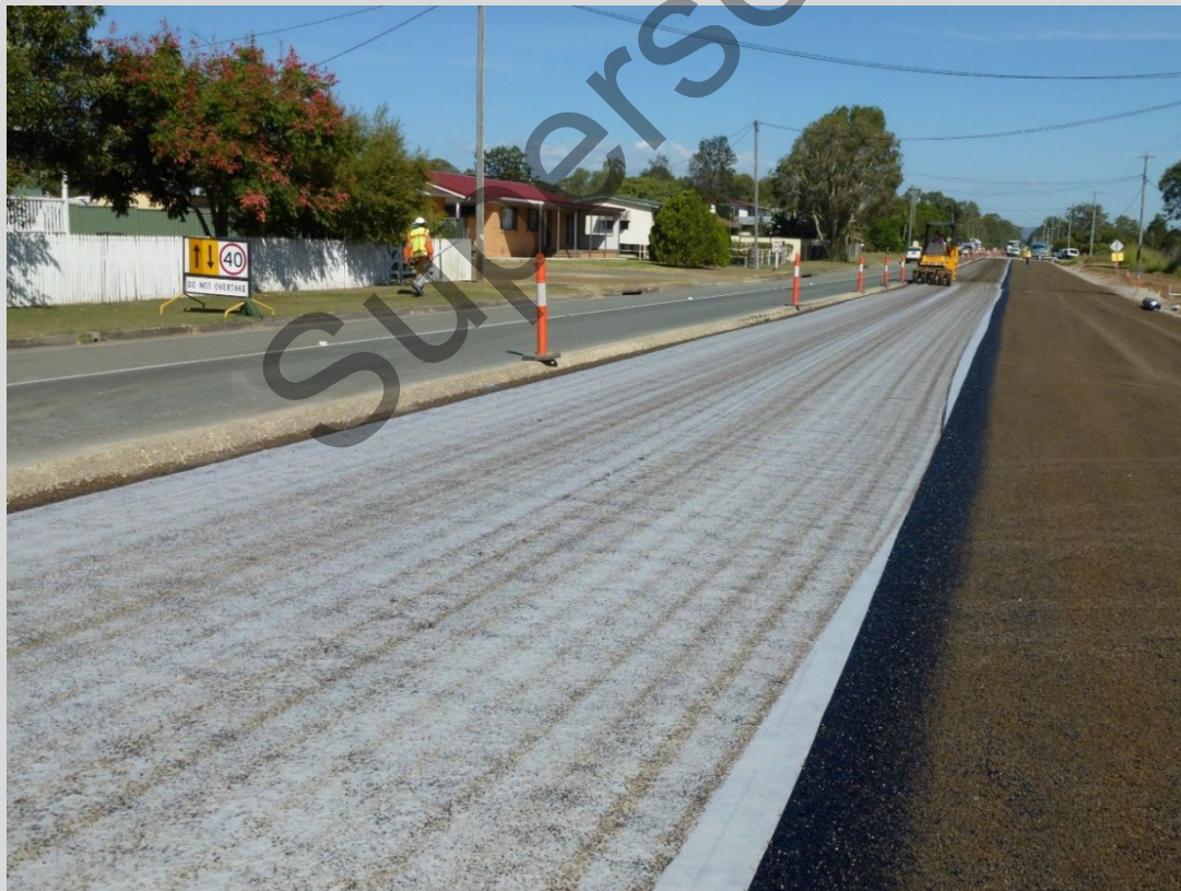
Figure 8.7.3(a) – Rolling geotextile using a multi-tyred roller to help impregnate the bitumen into the geotextile.

As a guide, the black boot prints of workers over the freshly installed geotextile can be considered as good indication the sufficient bond coat has impregnated into the geotextile.