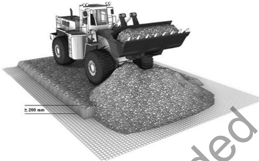
Figure 8.5 – Diagram illustrating granular or fill materials being placed on the geosynthetic in a manner which minimises damage to the geosynthetic