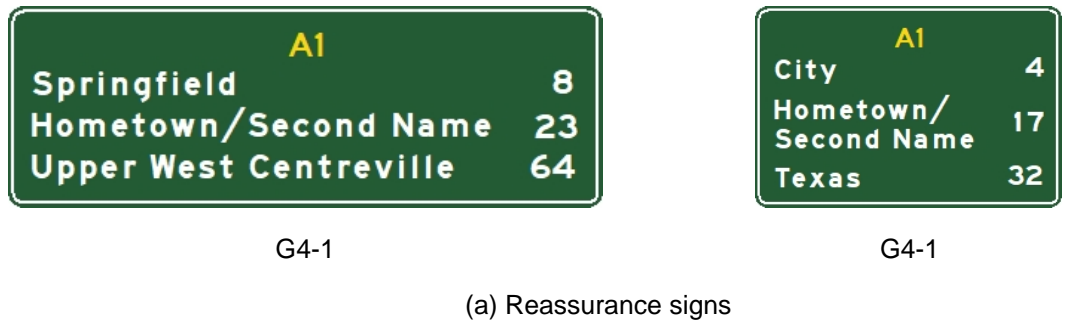
Figure 1.6.13 - Example signing of dual named places