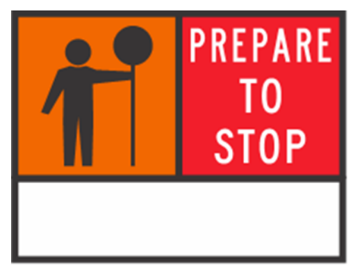
Figure 4.2.2 – Traffic Controller Ahead / PREPARE TO STOP Sign

The event TGS may specify that an ETM is required to place the sign (or other official traffic signs) at locations shown on the event TGS. If a sign cannot be placed where specified, the sign should be placed nearby (within 10 metres) of the specified location in a safe area where there is a clear line of visibility to and beyond the sign.