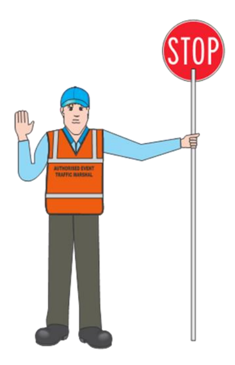
Figure 4.3.2 – Signal to STOP traffic