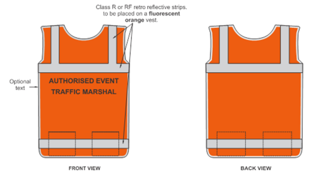
Figure 4.1 – Example fluorescent safety vest (AS/NZS 1906.4 / AS/NZS 4602)

Note: Fluorescent yellow safety vests and fluorescent yellow shirts are worn by accredited Traffic Controllers, and these shall not be worn by ETMs.