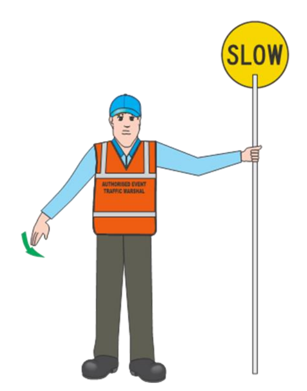
Figure 4.3.4(b) – Signal to SLOW traffic

• To slow traffic further if required, the ETM is to continue to show the SLOW side of the bat facing the traffic, give the TO GO signal by moving his or her free arm up and down but not above shoulder level (see Figure 4.3.4(b)).